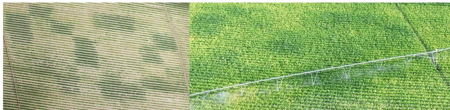
FIGURE 2 Aerial imagery showing visual color differences due to applied treatments in dry bean plots in 2017 (left) and maize in 2018 (right). Most dark crop rows correspond to char treatments. Treatments included no amendment or control, five levels of char (22.3, 44.6, 66.9, 89.2, and 133.8 Mg ha -1 ), two levels of biochar (5.6 and 11.2 Mg ha -1 ), two levels of composted manure (33.6 and 67.2 Mg ha -1 ), and two levels of municipal compost (33.6 and 67.2 Mg ha -1 )