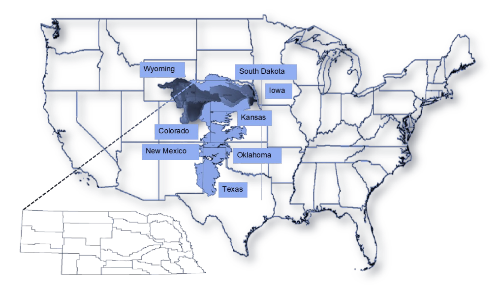
Figure 1. Platte River Basin (PRB) and Nebraska's natural resources. The deep blue tones evidence the main topographic features and PRB's sub basins. The light blue area is the High Plains Aquifer. At the bottom, it can be seen the state of Nebraska and its 23 Natural Resources Districts.

This study adds to that research by examining integrated surface and ground water management plans (IMP) in the Upper Platte River Basin, where Nebraska employs a statutorily enacted framework for state and local government cooperation in the integrated management of surface and ground water-the Ground Water Management and Protection Act (GWMPA) (Neb. Rev. Stat. §46-701 et seq.). In examining this framework, we relied on Ostrom's design principles for common pool resource institutions, because of its "bottom-up" perspective. Nebraska's unique system can represent an alternative to manage common pool of water resources worldwide. Water management in Nebraska includes a statewide agency, Nebraska Department of Natural Resources (NeDNR), with primary statewide authority over surface water, and 23 Natural Resource Districts (NRDs), public entities with taxing authority and primary responsibility for regulatory control over ground water (Figure 1). When state lawmakers established the NRD framework in 1972 there was a consensus that boundaries should follow surface watersheds and that local control was important to the citizens of Nebraska [4]. NeDNR and the NRDs are jointly responsible for facilitating the development of integrated water management plans.