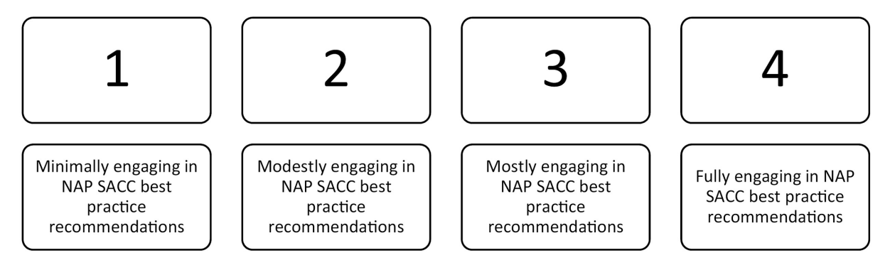
Fig. 2 Go NAPP SACC rating response categories

Providers completed the Go NAP SACC self-assessment which rates the FCCH on the extent to which they are meeting best practice recommendations for breastfeeding and infant feeding policies and practices. Items were ranked on a 4-point Likert scale, from "minimally engaging" to "fully engaging" in Go NAP SACC best practice recommendations (see Fig. 2 ).