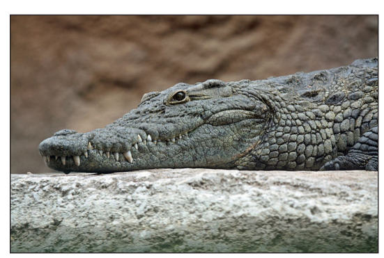
Figure 1. Nile crocodile ( Crocodylus niloticus ; (photo courtesy of L. Bedford under license https://creativecommons.org/licenses/by/2.0/).