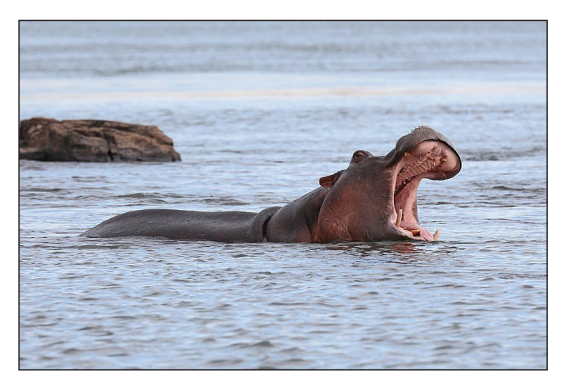
Figure 2. An African hippopotamus ( Hippopotamus amphibius).

Ploeg et al. 2019), the Nile crocodile ( C. niloticus ; McGregor 2005, Aust et al. 2009, Fergusson 2010, Chihona 2014, Zakayo 2014, Pooley 2015, Pooley et al. 2020), and the Phillipine crocodile ( C. mindorensis ; van der Ploeg et al. 2011). Our research focuses on the Nile crocodile that inhabits Lake Kariba, Zimbabwe. The Nile crocodile is widely disliked and feared (McGregor 2005, Pooley 2016) because it is perceived as being involved in the most fatal attacks on humans (Pooley 2016; Figure 1).