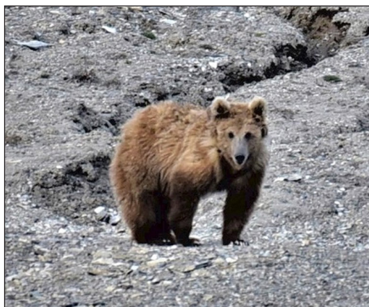
Figure 1. Himalayan brown bear ( Ursus arctos isabellinus ) near Photoksar in the Zaskar valley, northern India.

2020). Himalayan brown bears occur at elevations of 3,000–5,000 m above sea level, where they predominantly graze in alpine meadows (Sathyakumar 2001). Their diet is varied and versatile, consisting of approximately one-third animal matter and a variety of plants (Nawaz et al. 2019). Evidence of crops, garbage, and domestic livestock consumption has also been found in Himalayan brown bear scats in Pakistan (Nawaz et al. 2019).