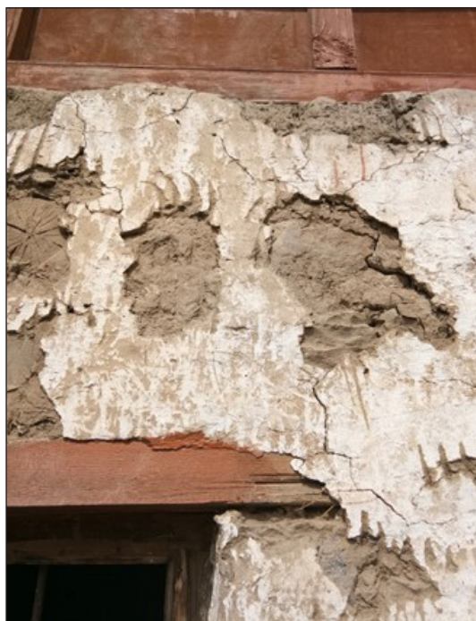
Figure 3. Himalayan brown bear ( Ursus arctos isabellinus ) claw marks on the façade of a house in the Zanskar valley, northern India.