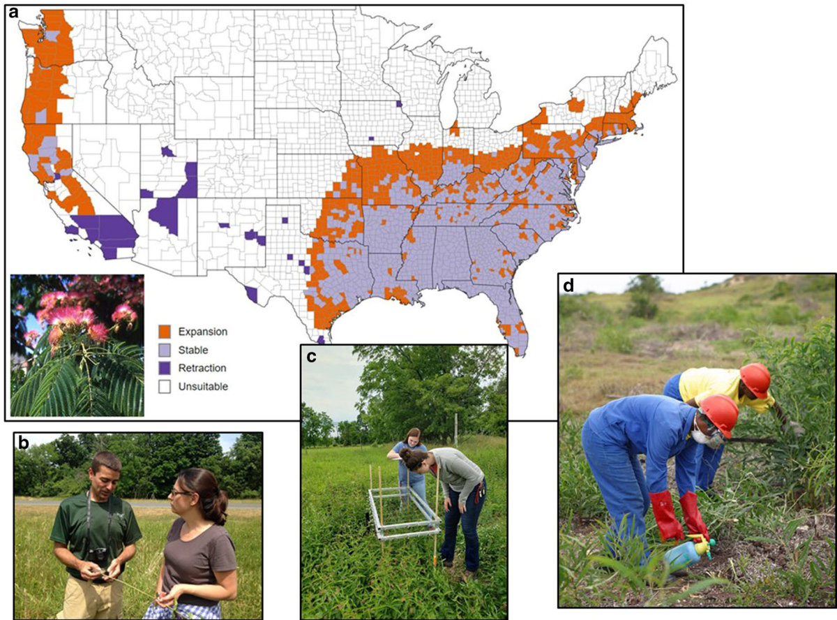
Fig. 2 Examples of Translational Invasion Ecology (TIE). a and b Conversations between researchers and managers (photograph by Carrie Brown-Lima, Cornell University, used with permission), yielded online maps of species potential range shifts with climate change (e.g., mimosa ( Albiza julibrissin , shown), a species with biodiversity impacts and suspected fire resilience;

photograph by Simon Garbutt, Public Domain). c Students set up monitoring plots to measure the effectiveness of a biological control agent (photograph by Jaclyn Schnurr, Wells College, used with permission). d Community members work to control invasive species as part of the Working for Water programme in South Africa (Photograph by Working for Water Programme, South Africa, used with permission).