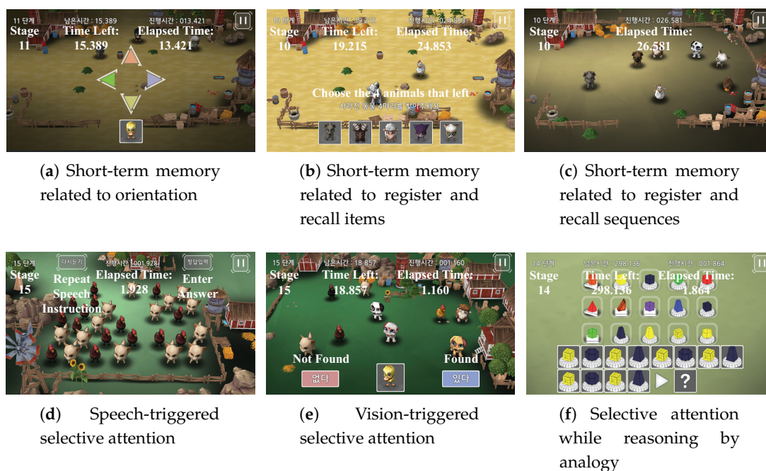
Figure 1. The screenshots of the six games of Neuro-World . All the games were administered in Korean, and English translations were added post clinical study for readers. A detailed explanation for each game is provided in Appendix A.