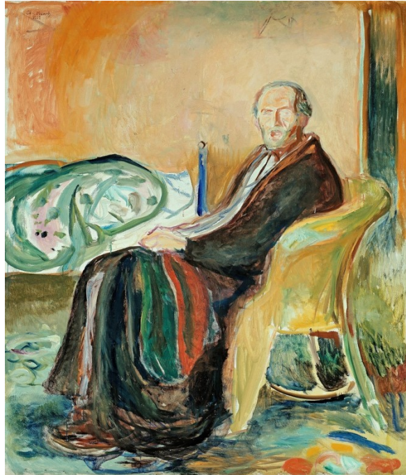
Figure 4: Edward Munch's 'Self-Portrait with the Spanish Flu', considered one of the few art pieces devoted to this disease. Accordingly, the Spanish flu has been called the “forgotten pandemic”. From the Wellcome Collection: https://wellcomecollection.org/articles/W7TfGRAAAP5F0eKS

norm for so long. Irrespective of the staggering numbers associated with it, therefore, the fact that this pandemic did not get the attention of contemporaries is perhaps not a major puzzle. This said, it seems clear that what we choose to celebrate, namely in the context of pandemics, is not uniquely dependent on the impact that the event had for contemporaries.