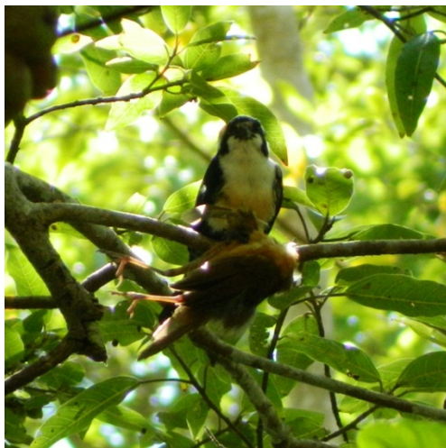
Plate 2. Black-thighed Falconet and its prey perched in Fig Tree