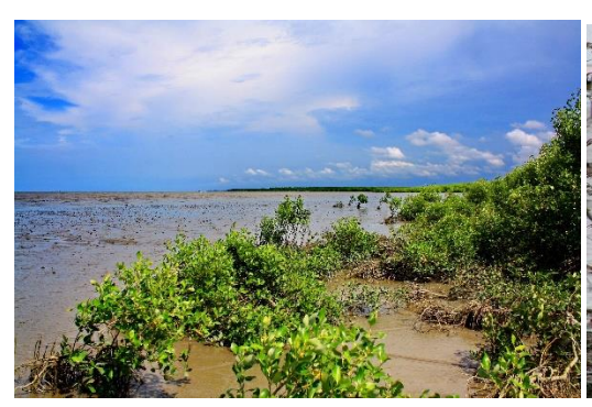
Plate 1. View of mudflat and mangrove forest around Tanjung Rejo Village.

We observed one Endangered migrant (Nordmann's Greenshank Tringa guttifer), two Vulnerable residents (Lesser Adjutant and Milky Stork Mycteria cinerea), and a Near Threatened migrant (Asian Dowitcher). Our counts of migratory shorebirds represent more than 1% of the flyway population for five species: Nordmann's Greenshank, Lesser Sand Plover, Pacific Golden Plover, Eurasian Curlew N. a. orientalis, and Ruddy Turnstone Arenaria interpres. Of particular note were large counts of Eurasian Curlew, making up 1-3% of the East Asian Australian flyway population of this uncommon subspecies (Bamford et al. 2008) across all months of the study (Tables 1, 2). Additional records of interest (from Tanjung Rejo in February) were of 8 Common Snipe Gallinago gallinago, 25 Ruff Philomachus pugnax, and 6 Greater Painted-snipe Rostratula benghalensis. The first two species are rare or scarce winter visitors and the latter is an uncommon and inconspicuous resident in Sumatra (Iqbal et al. 2013a). Two species were observed opportunistically during the study period (not on the standardized surveys): 12 Nordmann's Greenshanks were observed on 29 March 2012 at the Sei Tuan mudflat, and 25 Wood Sandpipers Tringa glareola were seen in a rice paddy near the village of Sei Tuan on 15 February 2011. Photographs of all species are available in Putra (2011).