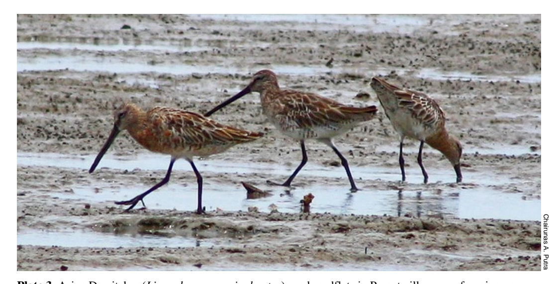
Plate 3. Asian Dowitcher (Limnodromus semipalmatus) used mudflats in Percut village as a foraging area.

The large numbers of migratory shorebirds we observed (totaling c. 20,114) are in accordance with previous studies (Crossland et al. 2012). While it is difficult to compare our results to those of Crossland et al. (2012) because of differing sampling methods, it appears that overall numbers of migratory shorebirds may be declining (see Wilson et al. 2011). One species that appears to be in decline is the Asian Dowitcher (Plate 3). Surveys from 1995 to 2009 yielded an average of 904 dowitchers (Iqbal et al. 2010; Crossland et al. 2012) while the maximum that we observed on the four mudflats in a given month was 96.