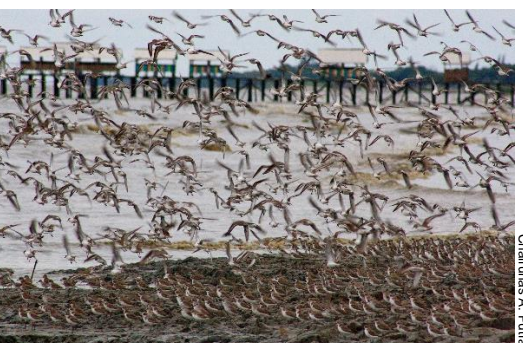
Plate 2. Large flocks of shorebirds on mudflat of Rugemuk village.