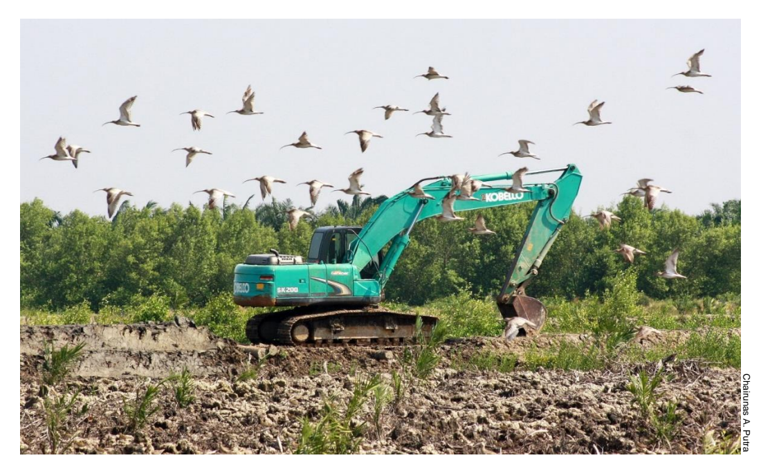
Plate 6. Disturbance of curlews at Sei Tuan, North Sumatra, by oil palm company, 28 October 2012.

As is the case across much of Southeast Asia, large areas of estuarine mangroves in Sumatra are being converted to human land uses, and shorebird and waterbird populations are likely to decline as a result (Verheugt et al. 1993; Mardiastuti 2000; Sandilyan et al. 2010; Spalding et al. 2010). Shorebirds use mudflats in the area for foraging and mangroves for roosting (Jumilawaty 2012). Mangroves are especially important roosting sites, for while long-legged waders are able to roost in deeper pools and mudflats, short-legged waders rely on mangroves for roosting during high tides (C.A. Putra, pers. obs.). None of the mudflats or mangroves in the region are protected, and mangroves in some areas, including our Sei Tuan study site, are being rapidly converted into oil palm plantations and fish ponds. While the Tanjung Rejo rookery is currently tolerated by resident fish farmers, the surrounding mangroves are under threat of conversion. Open ground in young oil palm plantations may serve as roosting sites, but planting and harvesting operations flush birds, and plantations may provide less cover from predators than other habitats (Plate 6). Fish ponds in the region are usually too deep to provide foraging or roosting habitat for shorebirds (C.A. Putra, pers. obs.). Conservation action is urgently required to secure roost sites for the globally important concentrations of shorebirds found in the Bagan Percut region.