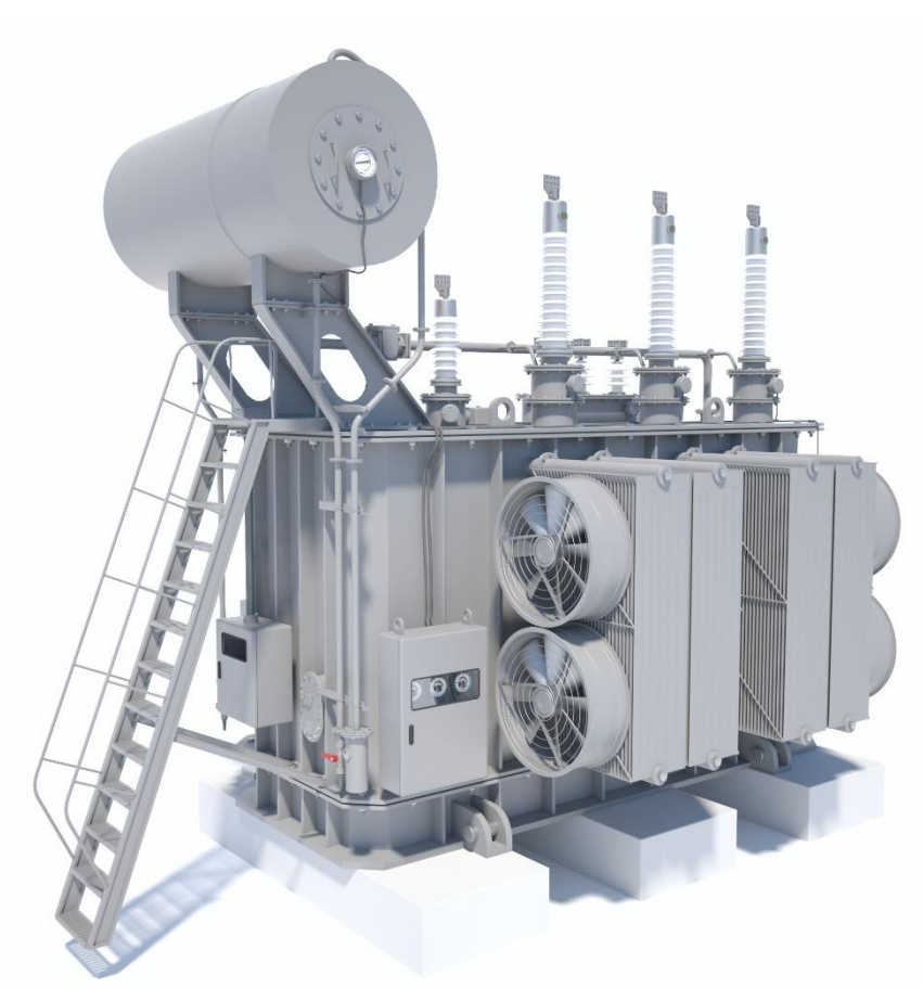
Fig. 3. Typical of wet type power transformer