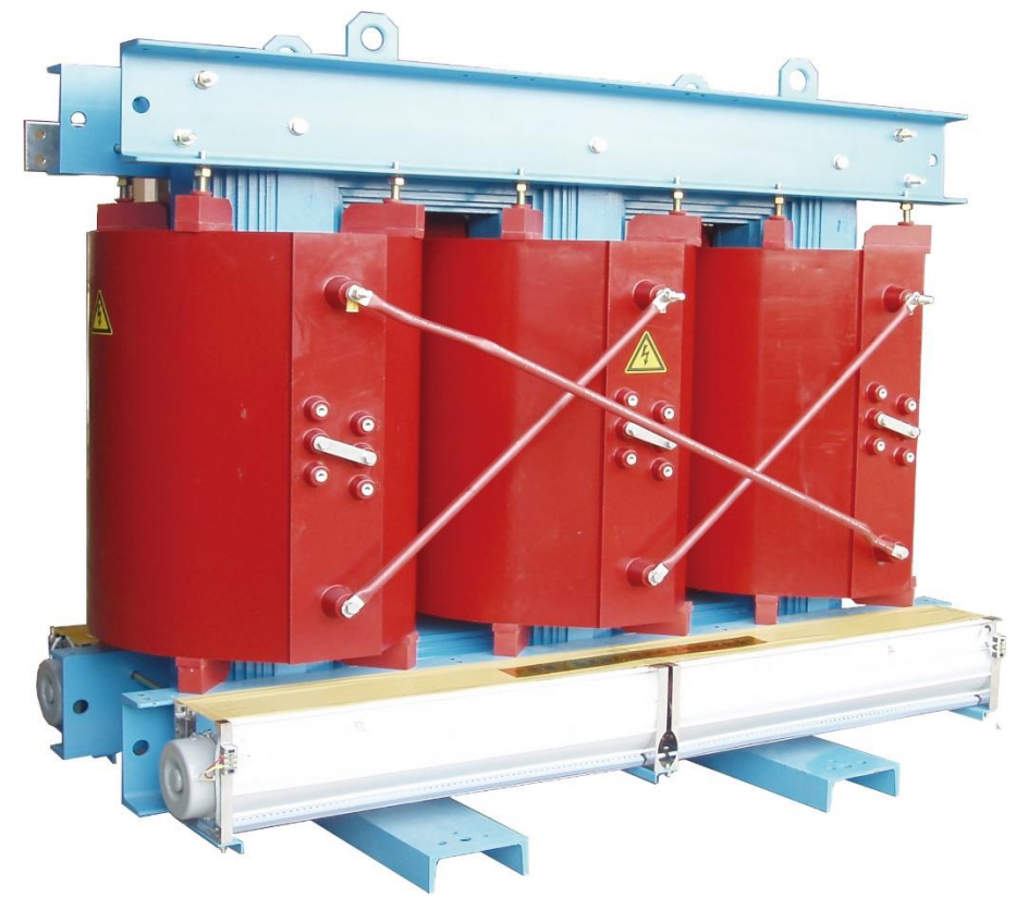
Fig. 2. Typical of dry type power transformer

ONAN (Oil Natural Air Natural) is a cooling system on a wet type transformer, which is cooling itself using natural circulation from oil. Through the current convection that has been regulated in oil circulated to the tank and cooling fins, the excess heat temperature in the transformer can be removed.