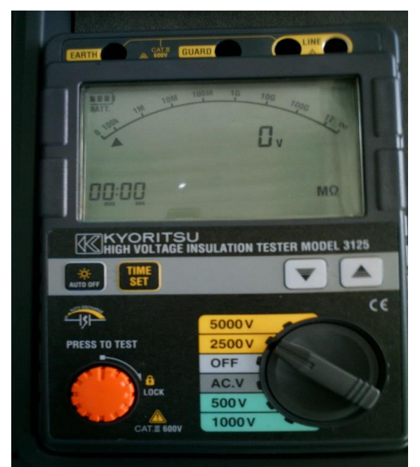
Fig. 6. Insulation test of power transformer using a high voltage insulation tester

Copyright © 2019 Universitas Muhammadiyah Yogyakarta - All rights reserved