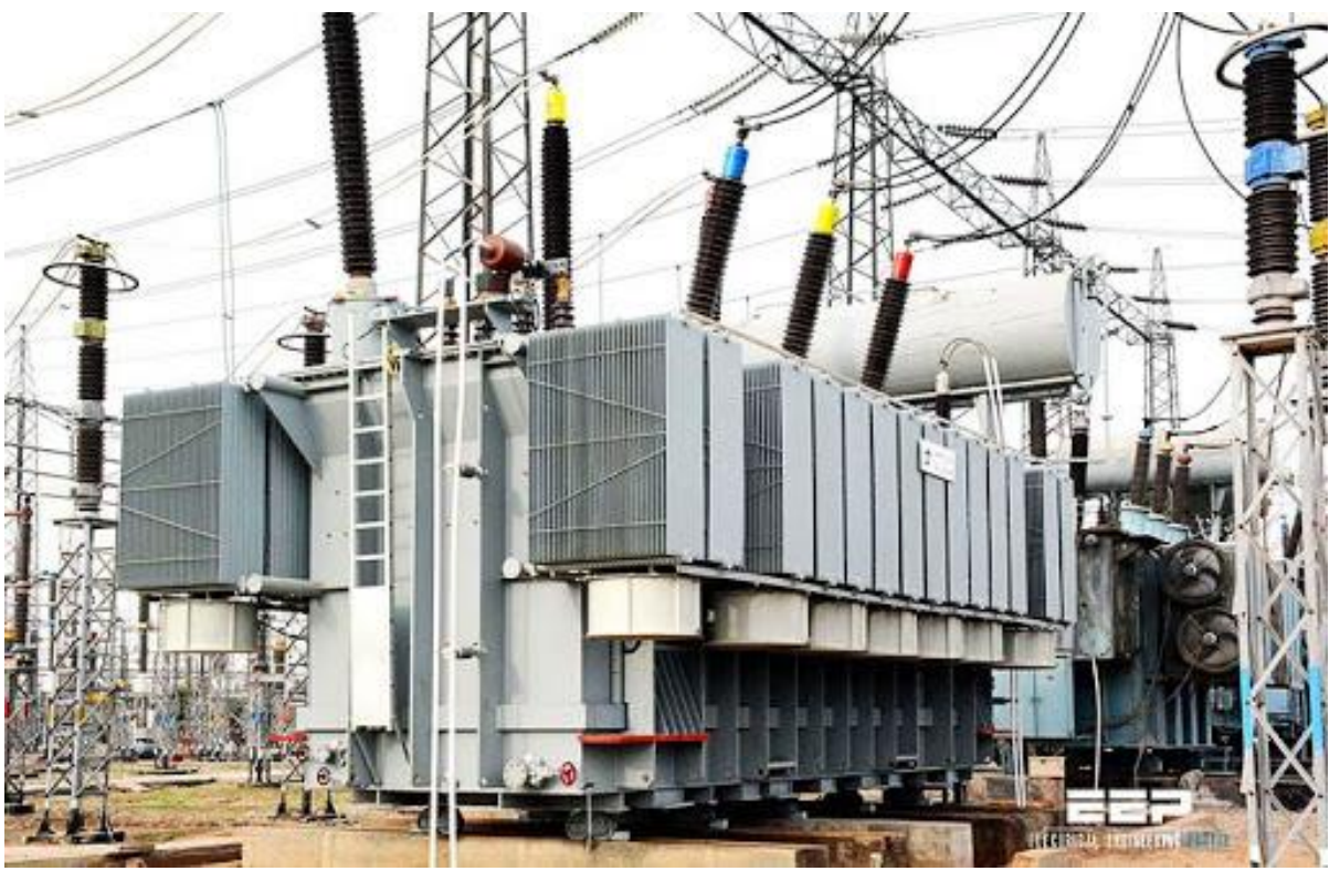
Fig. 1. The power transformer in a substation

A power transformer is a transformer that has a rating of more than 500 kVA and is mainly used to convert energy from generating stations to transmission lines, from transmission lines to distribution substations, or from utility service lines to distribution substations. Generally, these transformers are placed in 500 kV, 150 kV, and power generation systems. Figure 1 shows the power transformer in a substation.