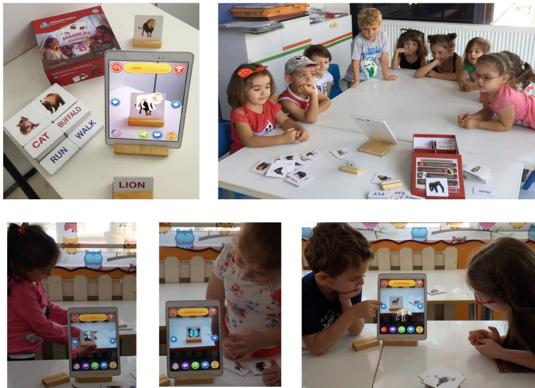
Figure. 4. On the left, contents of the 'Magical Animals' English learning set and on the right, kids playing with the educational set at a daycare center(Topsakal & Topsakal, 2019).

Painting platform augmented reality apps: Some apps work uniquely with flashcard sets that can be purchased in-store or via an internet purchase website. Each set of flashcards requires its software features; However, one application can perform multiple flashcards only if the same manufacturer makes them. Usually, these flashcard sets are not meant for language teaching; However, many AR-powered flashcard products show subjects, animals, and cars as vocabulary content.