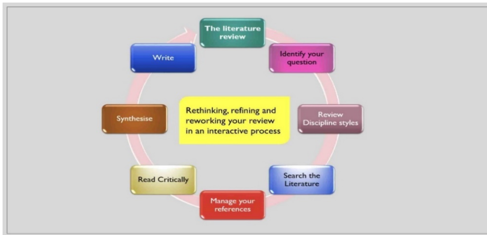
Figure 2. The procedure of doing a literature review

allows author to offer a more specific definition of technical competence and serve as a basis for further discussion and conclusions.(Osterweil et al., 2016).