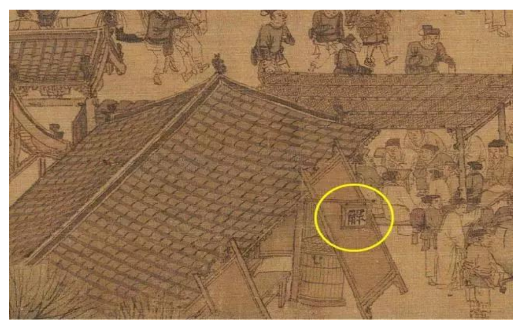
Figure 1. Recreation places on the Qingming Scroll

As a part of the construction of new socialist countryside, it should also focus on building a different, sustainable, and aesthetically pleasing countryside. This is one of the main concerns for building up the system of new-type urbanization. The construction of new rural areas will improve farmers' lives and then strengthen rural facilities and service networks. China with a large number of population concerns has always been a country dominated by agriculture. Even after industrialization, agriculture is still an important part of the People's Republic of China. Therefore, one of the foundations of urban construction is to promote the new development and construction of rural areas. In addition to improving the convenience network of natural villages, ethnic villages with historical, artistic, and scientific values should also be given special protection and reservation. In short, the new urbanization under the leadership of China's socialist core values is guided by the new China's scientific outlook on development. At the same time, it also integrates the concept of sustainable development into its construction basis.