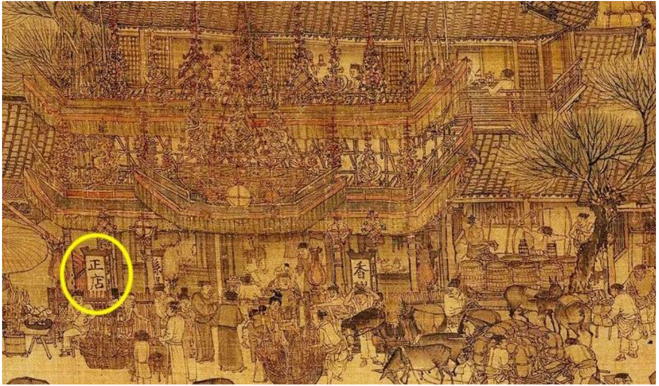
Figure 4. Shops (places for people to stay) on the Qingming Scroll