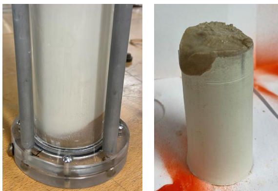
Figure 7. Sand slumping within the sedimentation columns and after extrusion

Using combinations of Speswhite and LBS E were not investigated any further primarily due to the fact this method creates two layers, a uniform sand layer overlaid by a uniform clay layer. A centrifuge model with these features can be created without the centrifuge as described in Grant (1998). This test did highlight the importance of sedimentation time and the resulting uneven layers.