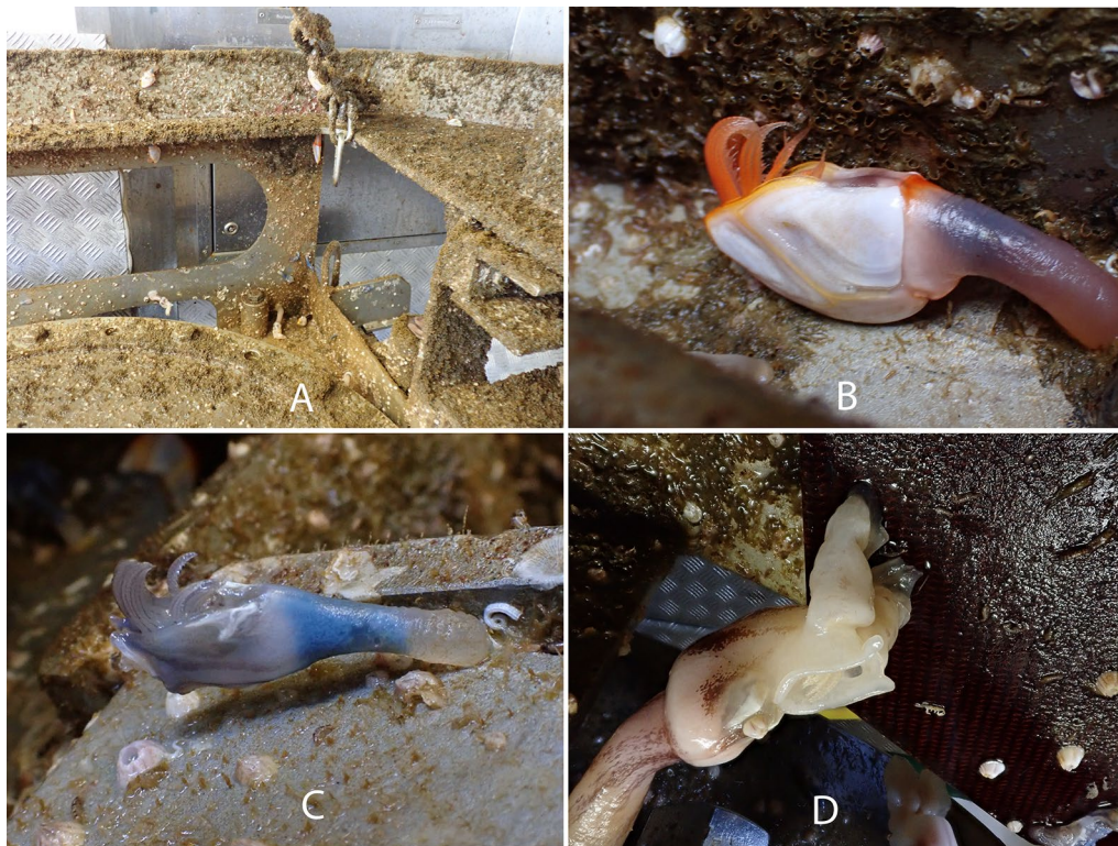
Fig. 3 At the end of our cruise the colonization of organisms was much denser (A) and especially the goose barnacles (B–D) were fully grown: B Lepas anatifera Linnaeus, 1758, C Conchoderma virgatum Spengler, 1789, D Conchoderma auritum (Linnaeus, 1767)