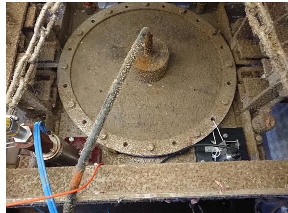
Fig. 1 At the beginning of installation of our device at 3rd August 2019 in Cape Verde already a sparse colonisation of the moon pool hardware was visible. Especially amphipod tubes, barnacles and some juvenile stages of goose barnacles could be seen

counted. Although the sample was only qualitative, all individuals were counted. The most common species were roughly estimated ( > 100 or > 1000 ).