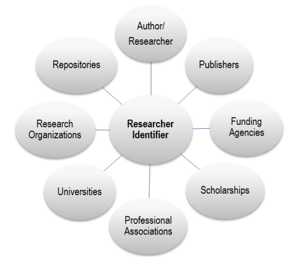
Fig 2. Application of researcher identifier