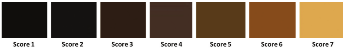
Figure 1. Color assessment parameters in organoleptic testing.

using the AAS method of flame. Cu-level measurement method using the AAS method is on, with a wavelength of 249.2 nm, acetylene/air flame type. Then, a standard solution is made and measured at wavelength so that its absorbance was visible. Furthermore, sample measurement was carried out in accordance with the procedure [10]. The process of testing the P 2 content using the atomic absorption spectrophotometry method with different wavelengths for each type of metal being tested [4].