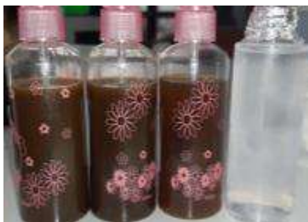
Figure 1. Aloe vera extract spray formulation results