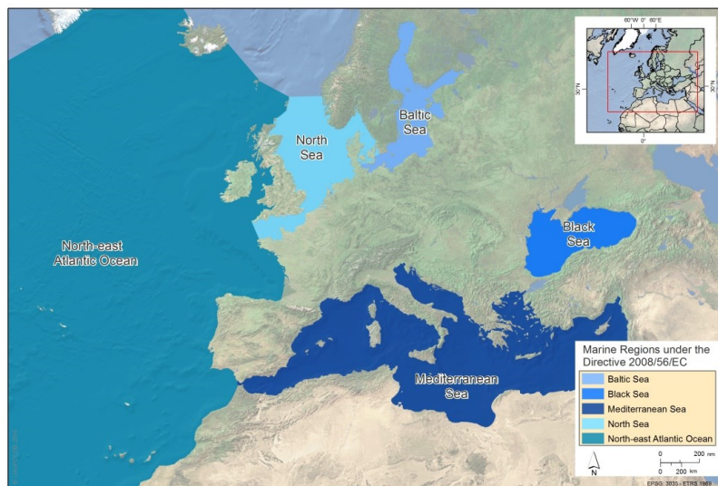
Fig. 3. Sea basins analysed under MUSES project (drawing on [1])

It is evident that MUs might differ in the EU sea basins due to their specific features facilitating development of some uses and hindering others. Five distinctive sea basins are defined in the EU sea waters if the outermost regions are not included: the North-Eastern Atlantic (EA), the North Sea (NS), the Baltic Sea (BSR), the Mediterranean Sea (Med) and the Black Sea (BS) (Fig 3). Each of these sea basins is characterized by different physical conditions resulting in different uses of sea resources. However, despite obvious differences, several common trends important for MU development are observed: 1) sectors dominating in the given sea basin seem to strongly influence development of MU, 2) environmental assets tend to have a more important role in allocation of the sea space to particular uses, 3) local and regional economic development is a driving force for local MU initiatives.