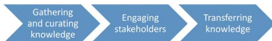
Fig. 1 Project setup: on the basis of gathered and curated knowledge, stakeholders were identified and engaged to facilitate knowledge transfer and to stimulate joint efforts

Phase 2: In this phase, stakeholders were engaged through participation in workshops, which served not only as tool to gather information from the