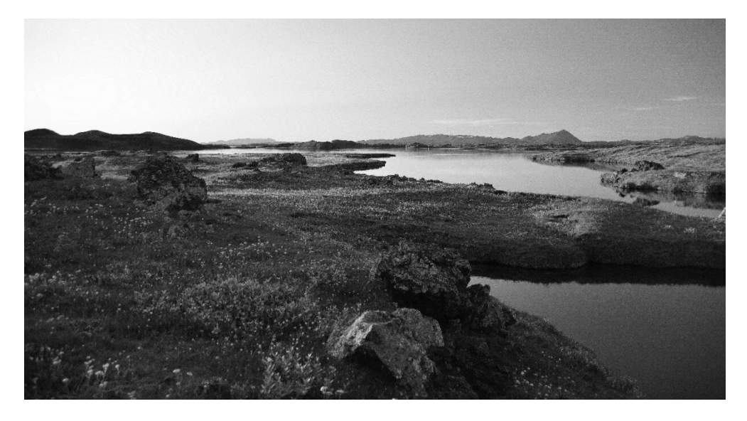
Fig. 4: Sampling location at lake Mývatn in north-eastern Iceland.