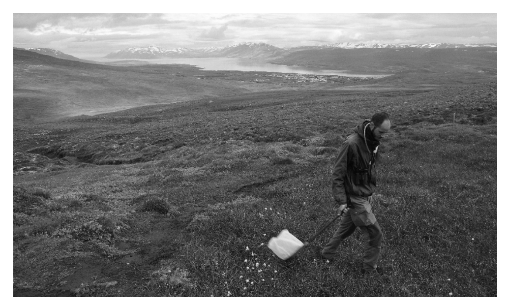
Fig. 2: The author sampling on mount Súlur, near the locality of Trioza anthrisci . In the background the town of Akureyri is visible.