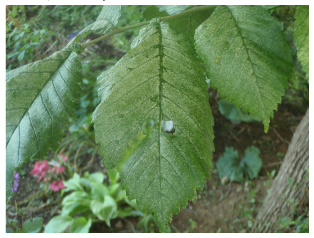
Fig. 3: Severe suction damage (whitish dots) on an elm leaf in the Reykjavík city centre. The holes in the leaf are consistent with the damage caused by the elm leaf beetle Xanthogaleruca luteola , but this species has not yet been reported from Iceland.

Ribautina ulmi was found in high numbers in the city centre of Reykjavík. All of the investigated ornamental elm trees ( Ulmus spp.) were heavily infested and suction damage was severe (Fig. 3). Ribautiana ulmi is widespread and common in Europe, occurring in Norway at least until just south of the polar circle (Endrestøl 2013b).