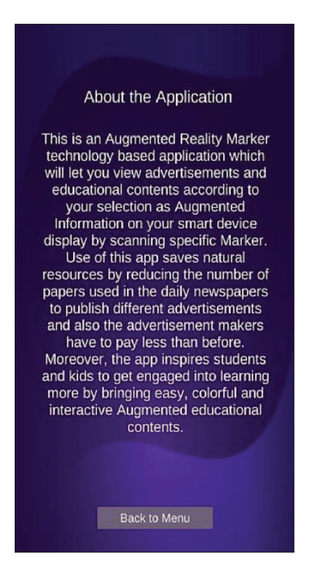
Figure 5: About

We have also figured out that we should be aware in case of information being presented while developing. This can prevent