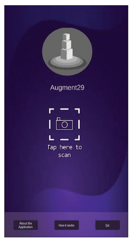
Figure 4: Home