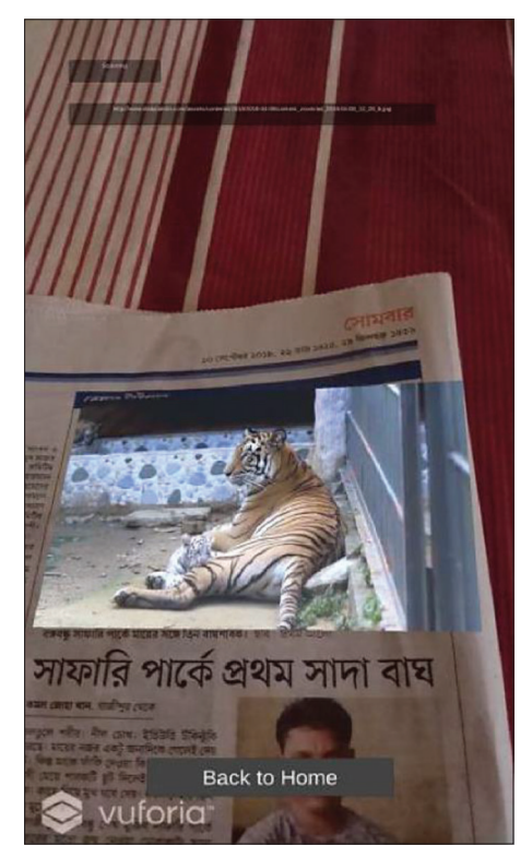
Figure 7: Sample output

the brain from being fully loaded especially in the case of students' audience. When the user feels overwhelmed stress can arise