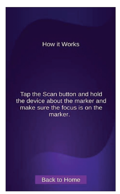
Figure 6: Manual

We have also figured out that we should be aware in case of information being presented while developing. This can prevent