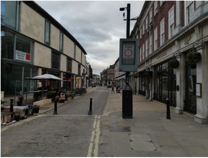
Fig. 3. York has complex time-restricted pedestrian zones, and being caught out is a £50 fine.

ratings. Some riders have lists of restaurants from which they reject work because of how long they are made to wait. Poor ratings and complaints can lead to workers becoming deprioritised which impacts available shifts, and could lead to eventual dismissal. The constant need to please restaurant workers and customers creates additional stresses and is a form of emotional labour. Concerns around ratings leads to suspicion around every interaction and how it might affect their future work.