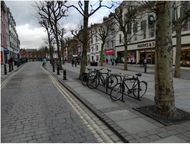
Fig. 4. Bicycle racks were removed for a Christmas Market and were not replaced till March.

their preference for low carbon transport. Such a zone could monitor whether certain vehicle types are being prioritised fairly and in accordance with environmental commitments. A Smart City environment could enable support for smart support stations for gig economy workers, and help city planners and policy makers use real world data to consider the growing gig economy in future cities.