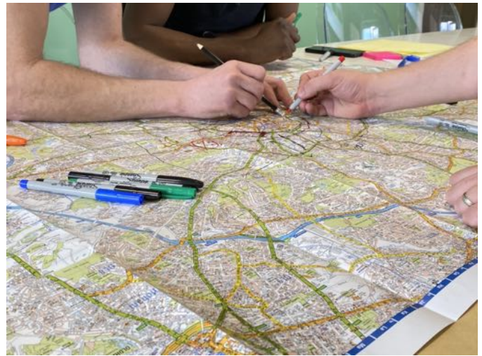
Fig. 2. Annotating maps was effective for sharing tacit knowledge about the city and the work

Gig economy couriers (like many other forms of gig worker) are drawn in by the promise of flexibility and the idea of making money riding their bicycles [2]. Due to the nature of food delivery work, mealtimes provide a peak in demand with riders chasing jobs, competing with one another as adversaries in attempting to increase resulting earnings [2], [11]. This competition drives down pay and creates an incentive that forces workers to work harder for the same pay, exposing themselves to risks to get an edge [2], [12]. Reviews and ratings play a significant role in a gig worker’s access to work; leading to reduced availabilities in work and even dismissal [11]. But couriers are savvy, smart experts, who enjoy their work and are happy there is no boss standing over their shoulder [2], [11]. They use technology and data to protect themselves, communicate and build solidarity with others, and resist injustice [11].