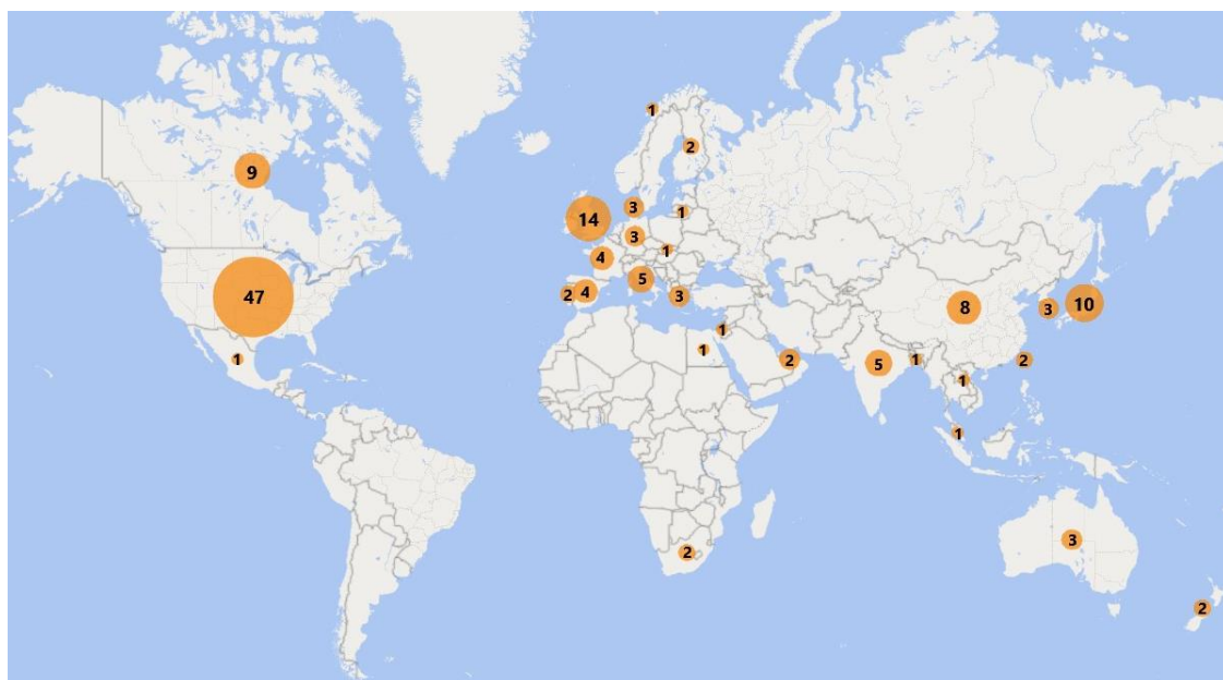
Figure 2. Number of IAQ studies included per country. Studies with IAQ data from multiple countries have been counted separately for each country.