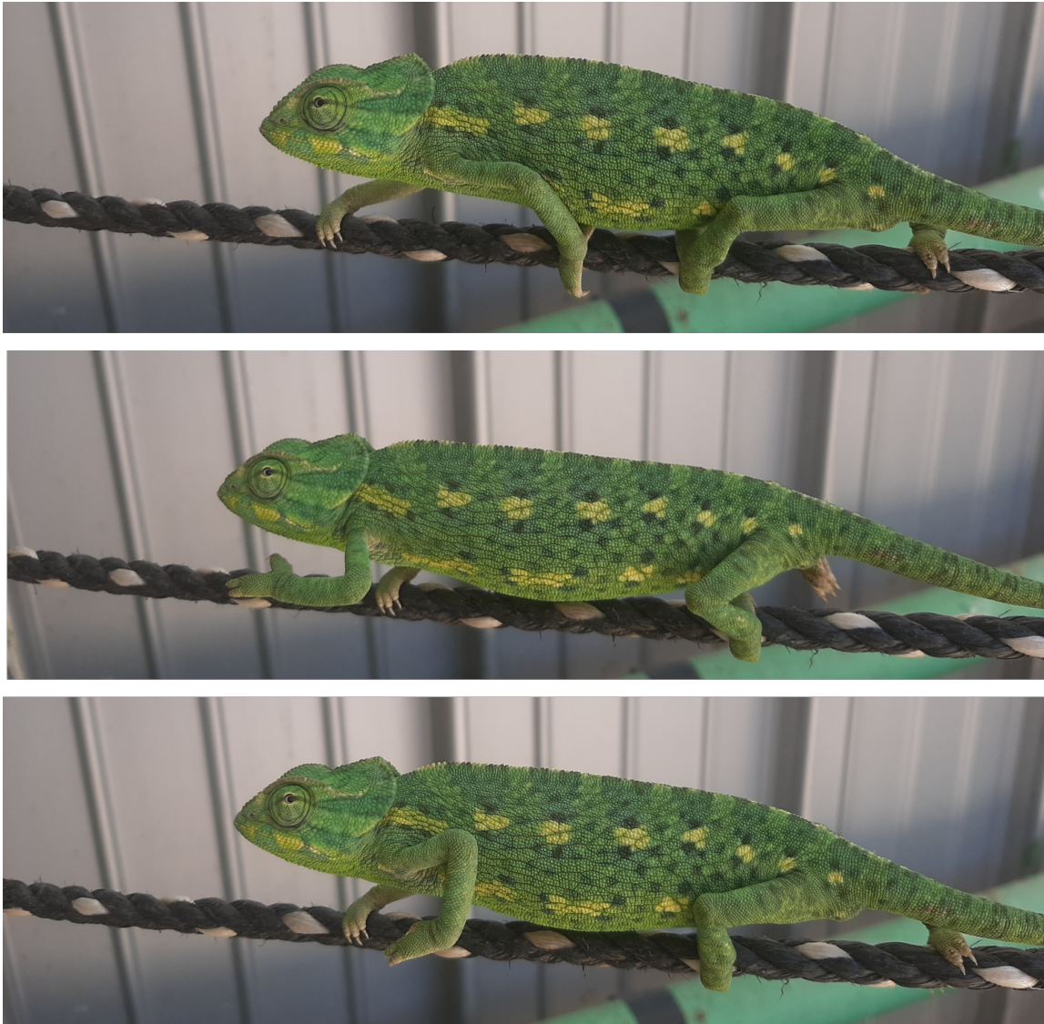
Fig. 1. Examples of different leg positions during chameleon movement.

recorded movement is presented in Fig. 1. We recorded 90 videos, resulting in approximately 8h of footage. Each video duration was determined by the individual's response and varied between 2 to 15 minutes.