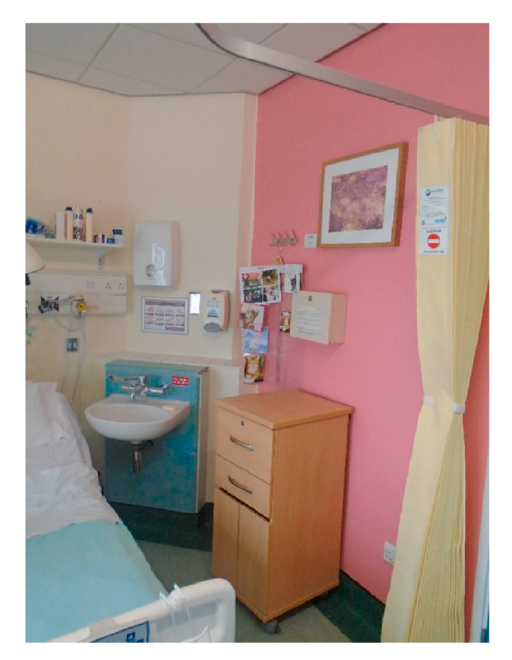
Fig. 7. One of the new colour schemes in a four-bedded bay with a shelf for clinical equipment, photo hanger and space on the locker for personal items. (For interpretation of the references to colour in this figure legend, the reader is referred to the Web version of this article.)

example, the transformation of the end of a corridor into a space for meeting and socialising (see Figs. 5 and 6) aimed to enable conversations and exchanges between inpatients/family members, and the space for photos and personal items in the bays aimed to generate exchanges between patients and between patients and staff that were based on the