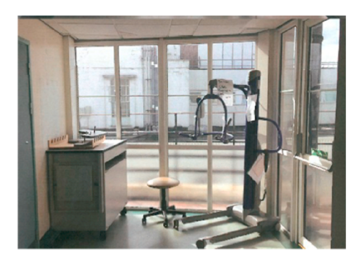
Fig. 5. End of a corridor at site 1, previously used for storing chairs and hoists.

They were also intended to enable different types of interactions. For