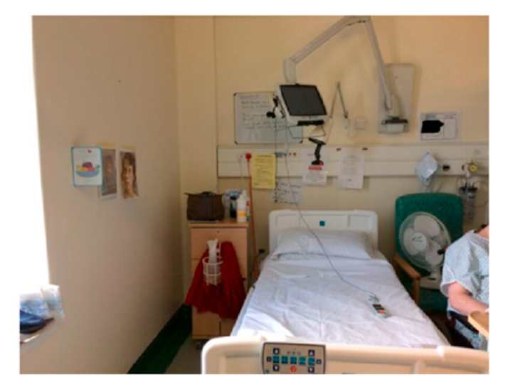
Fig. 4. Typical bed space and décor described by patients and staff as cluttered and uninspiring.

And it looks very much like a hospital environment, I think the colours are very hospital-y, I think the decor is a bit shabby and when you're spending months in this hospital sometimes it just feels like there's nothing that looks particularly homely. (Interview, Patient)