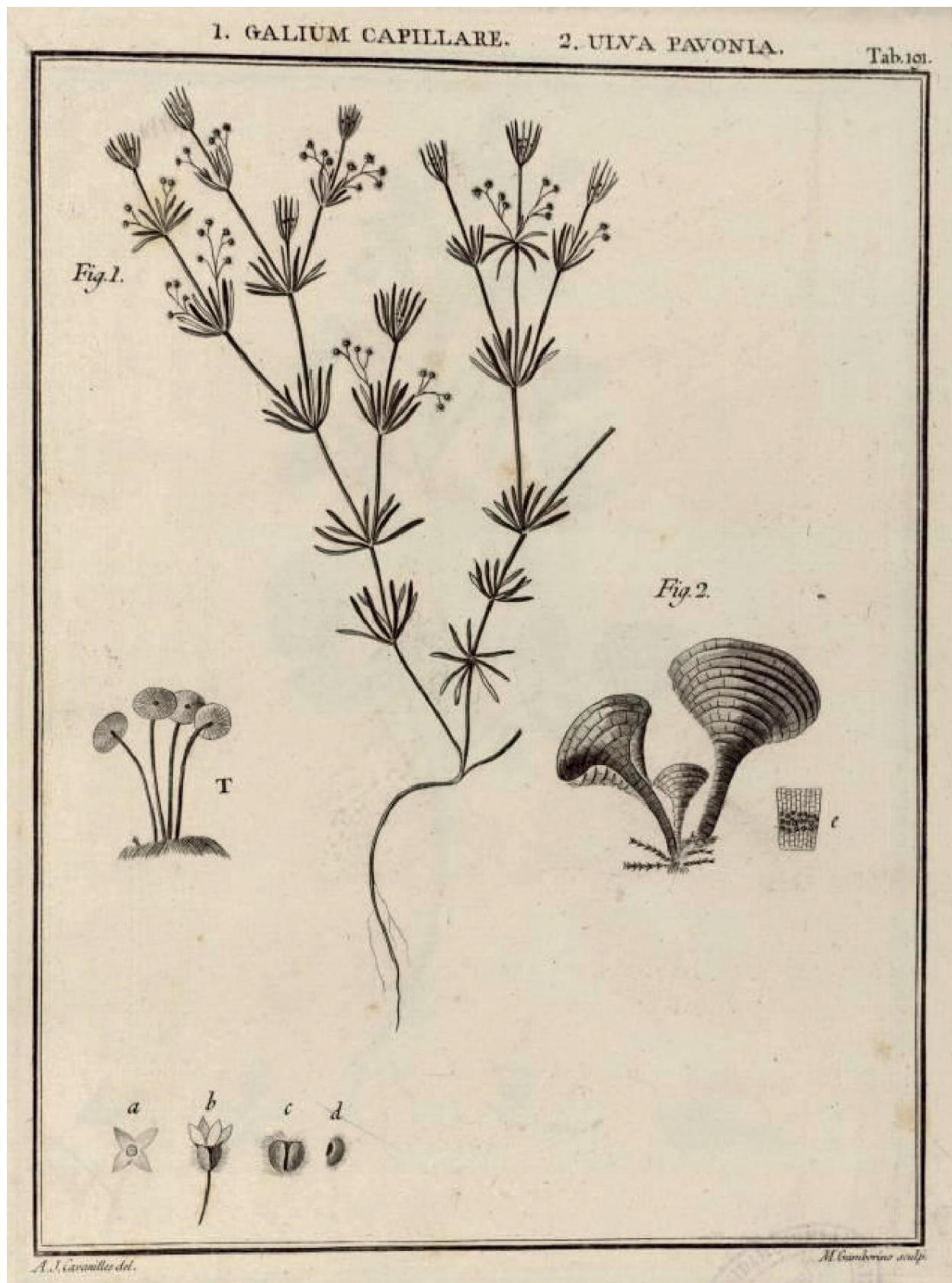
Figure 1. Lectotype of Galium capillare Cav.; [illustration] “ Galium capillare ” in Cavanilles (1793: tab. 191, fig. 1).