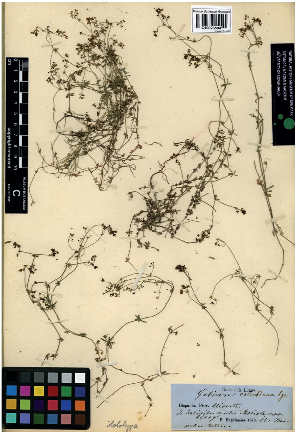
Figure 2. Lectotype of Galium valentinum Lange; C10023594.