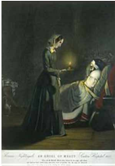
[Florence Nightingale, An angel of mercy . Scutari hospital 1855