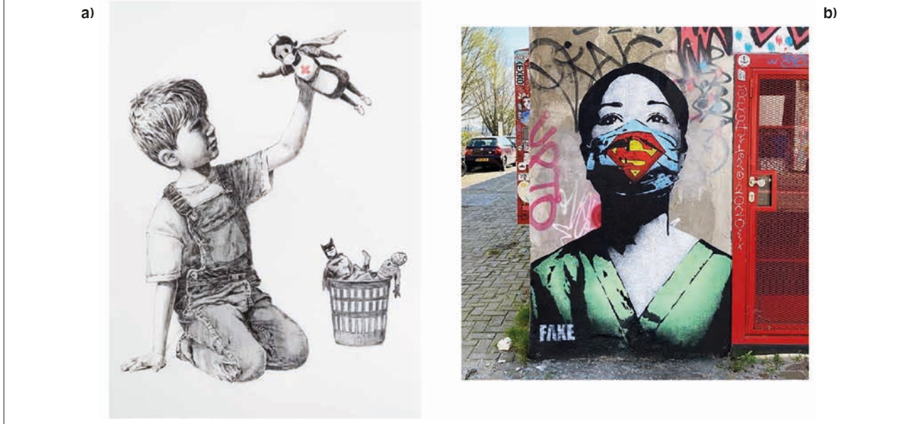
Fig. 2. a) Banksy new masterpiece “Game Changer” - 2020. The objective of his work is to replace fiction super-heroes with real superheroes, the ones working in NHS and facing day by day SARS-CoV-2. b) of the same opinion is the famous writer Fake who dedicated the “Super Nurse”- 2020 to healthcare workers in difficulties during COVID-19 management.