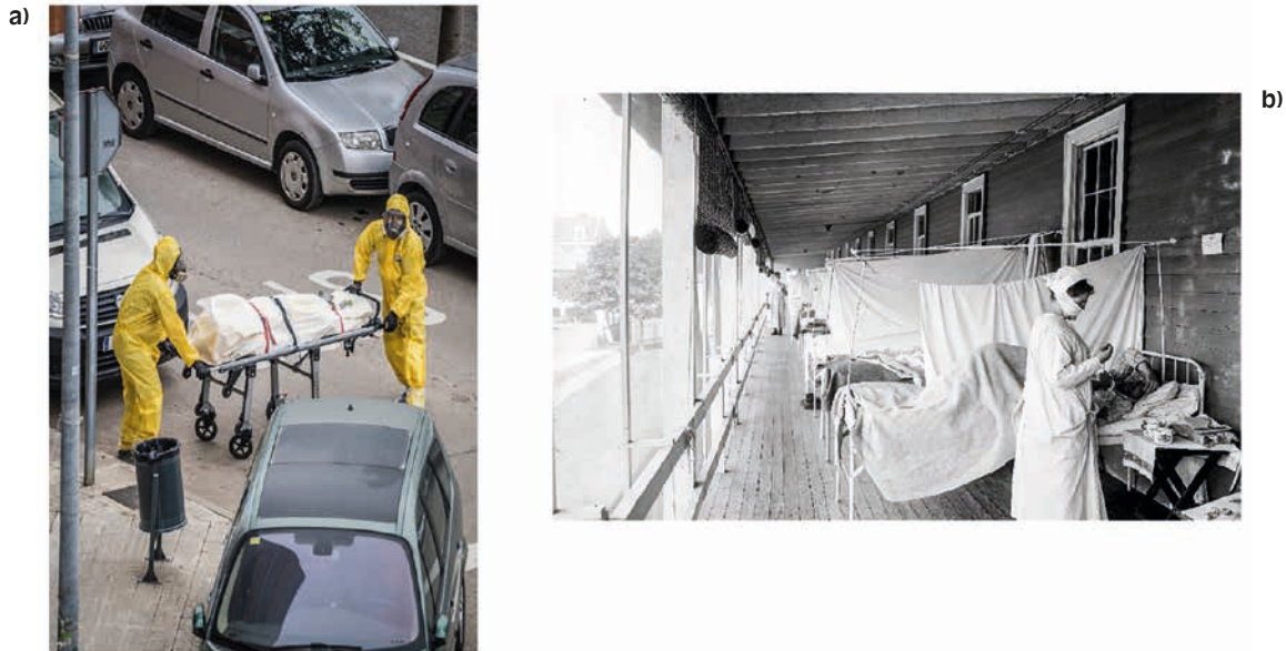
Fig. 3. a) Paramedics with PPE transporting a corpse during the COVID-19 pandemic. b) The influenza ward at the Walter Reed Hospital in Washington, 1918. Simply-to-make protective masks were worn by healthcare workers.

daily life during both pandemics; in the light of the current pandemic, the concept of normality has been revised. Since the first COVID-19 lockdown, several cultural initiatives have featured photography. One example is the foundation of the Covid Photo Museum (CPM), the world's first virtual museum dedicated to the photography of the COVID-19 pandemic [41].