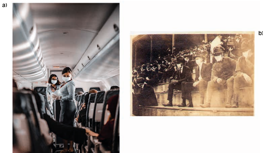
Fig. 4. a) Everyday life in 2020 means face mask adoptance in public places included flight. b) Football match audience wearing protective masks during the Spanish Flu epidemic of 1918.

Although only 0.1% of the 1,600,000 viruses capable of causing epidemics and/or pandemics are known, the 2020 pandemic was randomly forecast by Johns Hopkins Center for Health Security. Indeed, a model of an imminent pandemic was created and called CAPS