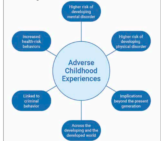
Fig. 2. Implications of Adverse Childhood Experiences on health and wellbeing.

America are estimated to have multiple ACEs, and these individuals could carry the health-harming behaviors and eventually chronic disease [1];