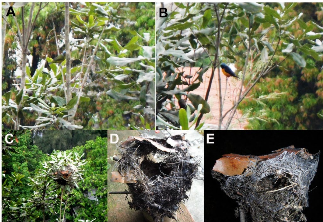
Figure 1. E. elegantissima female (A) and male (B) observed close to their nest, perching on a macadamia nut tree ( Macadamia integrifolia ) in the environs of the city of Xalapa (urban site U). C) Nest U1 located between M. integrifolia branches and leaves. D) Supra-posterior view of nest U1; small M. integrifolia branches and leaves removed to show their structure. E) Frontal view of nest U1 showing the entry and the cobweb that joined roof leaves.

Nest SB4. During March and April of 2017, a couple was observed in the same site where couples had appeared in previous years. Their nest was also under a sword fern ( Nephrolepis exaltata ) growing in a hanging pot only 3.5 m from nest SB3.