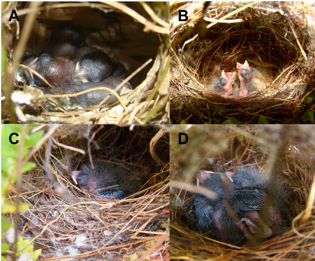
Figure 5. E. elegantissima altricial chicks. A) Four chicks from nest SB2 (July 2014) constructed under hanging potted Acalipha reptans . B-D) Two chicks from nest SB3 (April 2015) built under the hanging potted sword fern Nephrolepis exaltata , of three (B), nine (C), and ten (D) days old.

Nest SB3. Throughout the day of 25 April 2015, the two parents alternated visits to the nest, the male always visiting first. Apparently, the male performed no brooding and only fed chicks: in all observations, rather than entering the nest it remained perched near the entrance. Escorting behavior was observed in both parents, either when the female visited the nest (escorted by the male; Supplementaryvideo3) or vice versa (Supplementaryvideo4). Both parents perched in neighboring trees and plants before visiting the nest. The following behavior occurred several times (27 april-1 may): the male perched on a tree vocalizing and pecking at a twig several times during 20–30 s, until the female arrived and, once quite close to him, made a fluttering. After that, the female flew to another tree and the male repeated the “twig pecking” behavior three times; then the female returned and fluttering again. The couple then flew to the nest; the male entered first being replaced by the female after a few seconds. Once the female left the nest, both parents flew away.