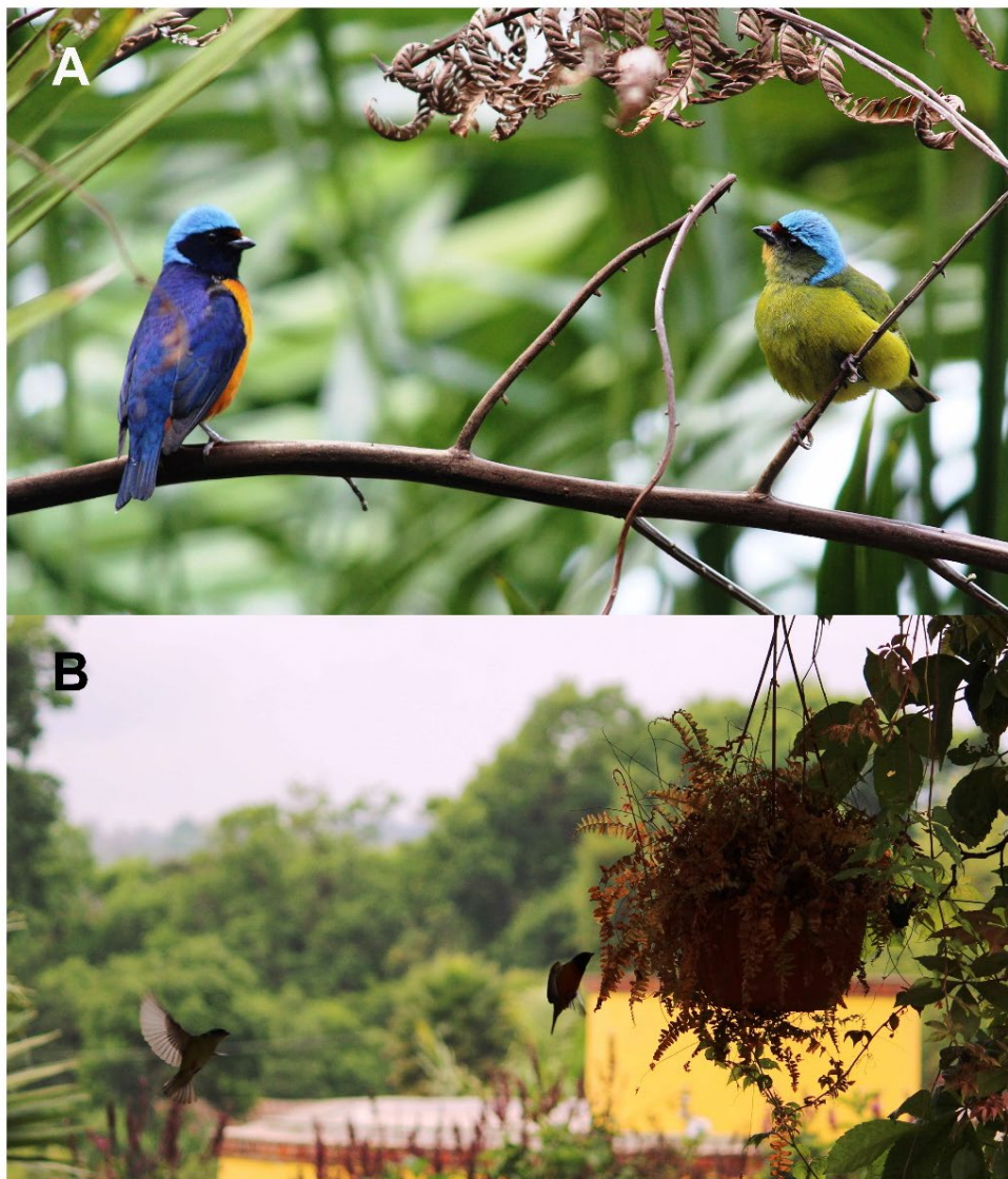
Figure 6. Suburban nest SB4. A) Male and female perched close to the nest. B) Female escorting male during a visit to the nest to feed chicks.

On average, the male spent more time in the nest (mean = 109 s, range = 35–300 s, N = 9) than the female (mean = 52.6 s, range = 25–99 s, N = 7), although differences were not significant (t-test, P = 0.10 ). When time in nests was related to the time elapsed since hatching (Fig. 4), a reduction in nest time was observed in both the male and the female after two days (50 hours), with a recovery in both genders after 7 days (171 hours). Although three eggs were laid, only two chicks were observed throughout the nestling phase (Fig. 5B, C, D). Three days after hatching, two chicks with down were observed (Fig. 5B). They began to develop feathers after nine days (Fig. 5C, D). On 15 May the nest was empty. In summary: i) Both, male and female cared for chicks, feeding them while standing outside the nest at its entrance. ii) Escort to the nest during feeding was done by both genders, the male always flying first. iii) On average, the male spent more time in the nest than female (Fig. 4). iv) Feeding and brooding of chicks lasted 21 days.