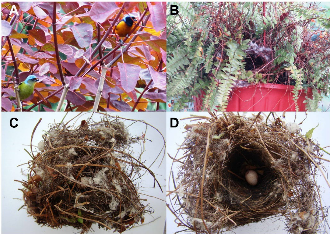
Figure 2. A) E. elegantissima female and male observed during the nestling phase, perching on a Euphorbia cotinifolia shrub at suburban site SB (April 2015). B) Nest SB3 constructed by this couple under hanging potted fern Nephrolepis exaltata , showing lateral entrance. C) Supra-posterior view of SB3 extracted nest. D) Superior view of the same nest after roof removal, showing an injured egg that never hatched.

Nest SB5. Corresponds to nest SB4 that was occupied again, only 48 days after the juveniles' flight and quite probably by the same couple.