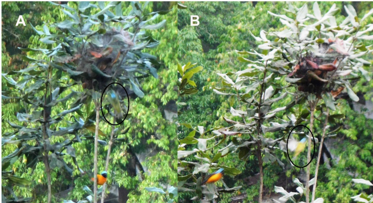
Figure 3. A) E. elegantissima female observed flying towards nest entry while the male is perched below (nest U1 construction phase); the nest is on a macadamia nut tree ( Macadamia integrifolia ) five-branch fork. B) The same female flying towards nest, closely followed (escorted) by male (nest U1 incubation phase). In both figures, the female is within a black ellipse.

Nest U1. As of 24 April 2014, two different behaviors were recognized. The first was observed over three days once nest construction was finished. During this period, the female remained in the nest for a few minutes: 2, 4, and 5 minutes in two morning observations, from 06:35–07:35, and one in the afternoon at 17:50. We also observed the male escorting the female (Fig. 3B; Supplementaryvideo2), and in one of three observations, the female returned to the tree only 30 seconds after leaving the nest. This behavior probably corresponds to the female’s egg-laying period.