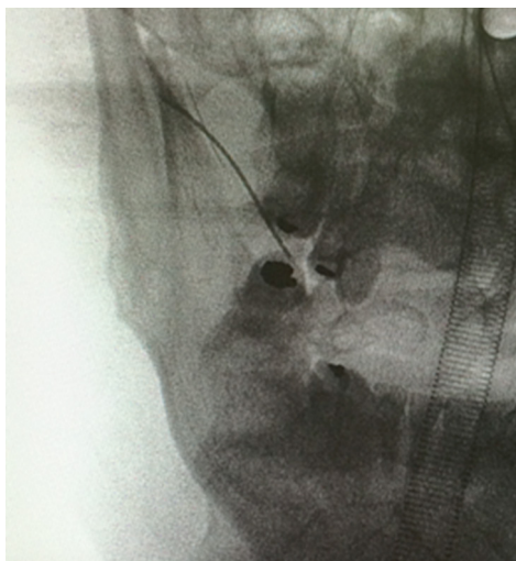
FIGURE 2 | Trans-operative image of the needle (image intensifier).