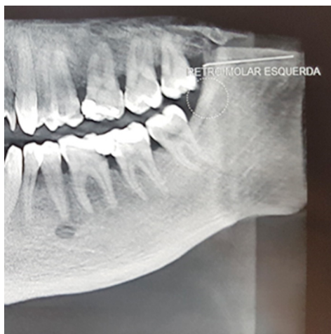
FIGURE 4 | Tomography showing the presence of a broken needle on the left side.

After the procedure, a control radiograph (Figure 5) was taken, in which the presence of the radiopaque object was no longer observed. The patient is currently under post-operative follow-up for 90 days, with no functional complaints.