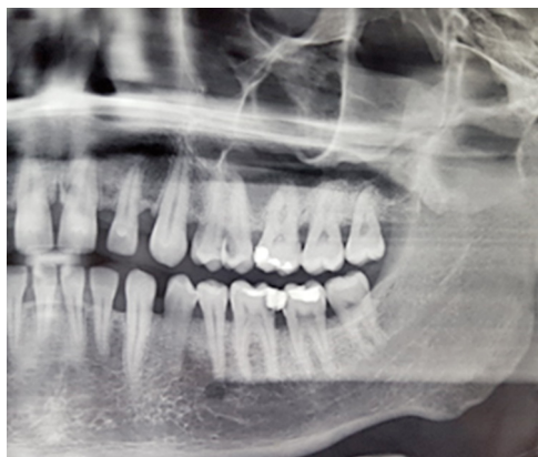
FIGURE 5 | Postoperative panoramic radiograph showing the absence of the broken needle.