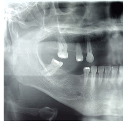
FIGURE 3 | Postoperative panoramic radiography showing the removal of the broken needle.