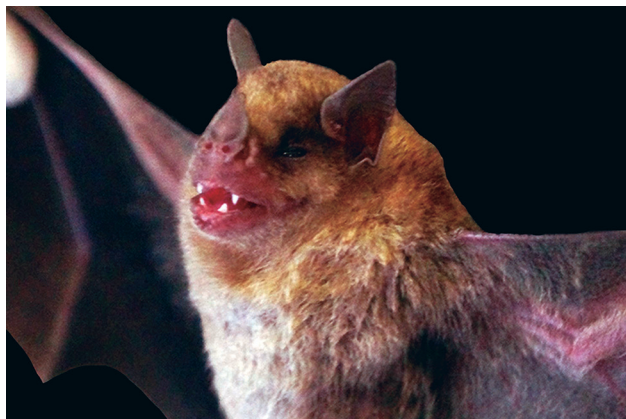
Figure 1. Sturnira tildae (female, RRM 117) collected em Cândido Mendes, in the Amazon biome of Maranhão state, Brazil.