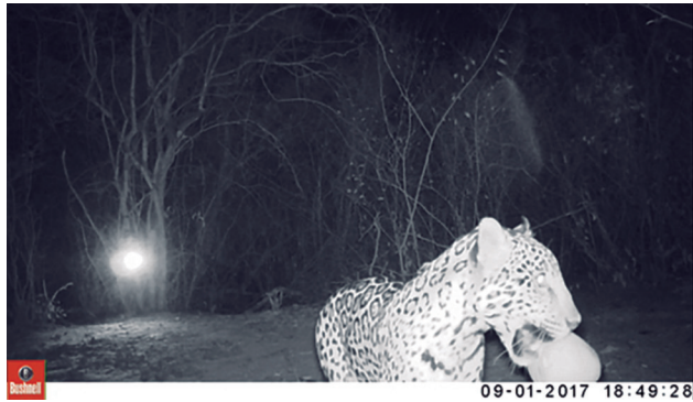
Figure 2. Record of a jaguar ( Panthera onca ) carrying a Brazilian three-banded armadillo ( Tolypeutes tricinctus ) in its mouth in the municipality of Brotas de Macaúbas, state of Bahia, Brazil. This photo is from a 15-second-long video recorded by camera trapping.

small trail sometimes used by local people, covered by shrubby vegetation and close to roads and wind turbines (12°17'26.94"S, 42°21'45.84"O). The video shows a P. onca individual carrying a T. tricinctus individual in its mouth. T. tricinctus was completely rolled up in its defensive position, and P. onca was holding it by the left canines.