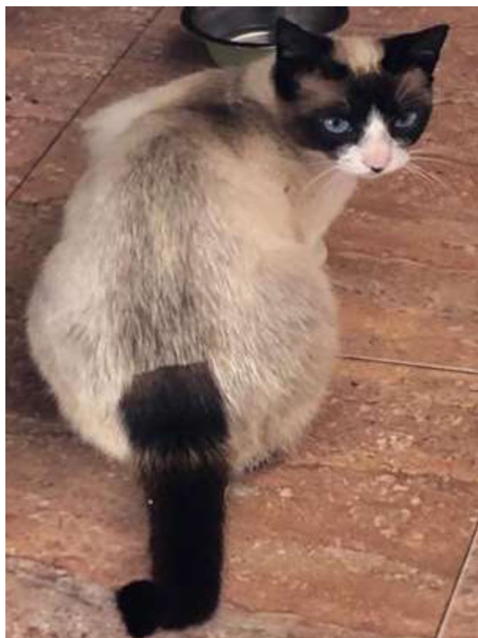
Figure 1 – Fur color change of sacrococcygeal region, 6 weeks after sacrococcygeal epidural anesthesia administration.

skin changes (pyoderma, panniculitis, vaccine reactions, traumatic injuries). In the dog, it is described as occurring after treatment of endocrinopathies (Miller et al., 2013a). In this sense, the trichoscopic examination was considered of little diagnostic value for the case in question. The skin and new hair growth of the shaved abdomen did not present any abnormalities. Six months later the skin color of the sacrococcygeal region returned to its normal appearance.