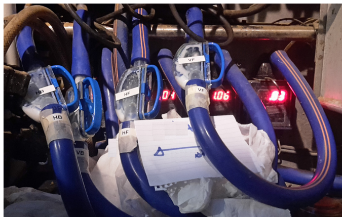
Figure 1. Installation of holders and filters along the milk tube before the milk meter of each teat cup.

sumed to vary more than at the cow composite level. A scale, adjusted to scoring clots at the quarter level, was therefore defined using 200 images collected at farm A before the trial for training and evaluation purposes.