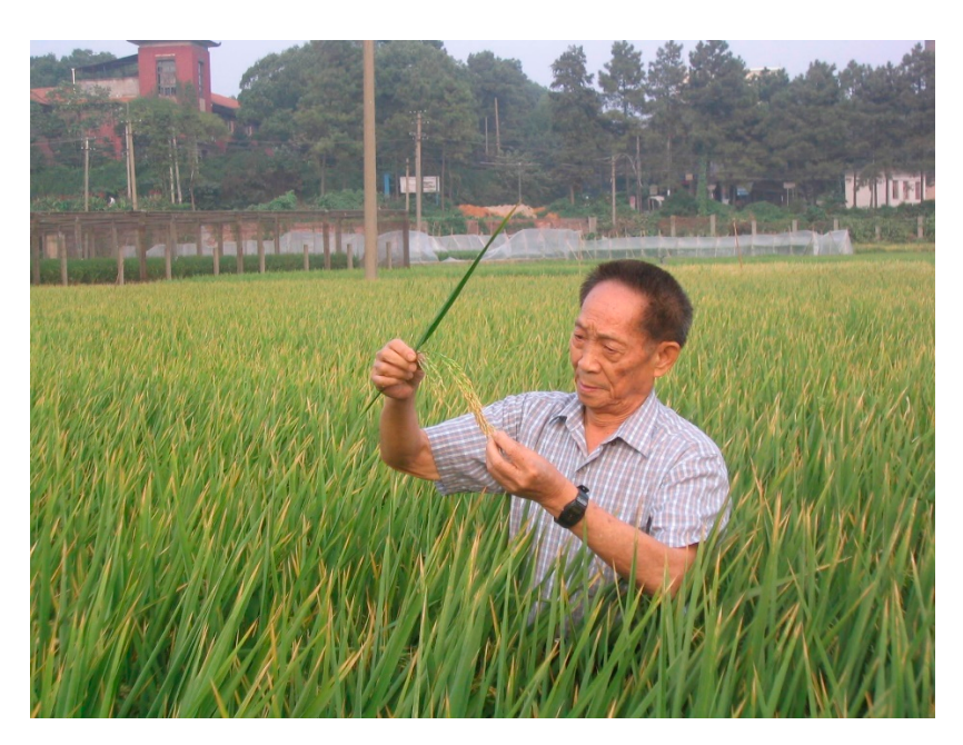
Figure 1. Professor Longping Yuan in the rice field.