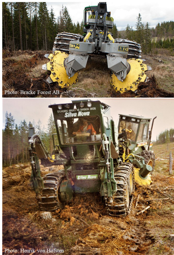
Figure 1. Site preparation with a 2-row disc trencher (top), and with the Midas disc trencher on the Silva Nova planting machine of the 1990s (bottom)

Nova (Ramantswana et al. 2020). However, in our view, certain improvements like planting spot detection and autonomous route finding are required to make continuously advancing tree planting machines (such as PlantmaX) more competitive.