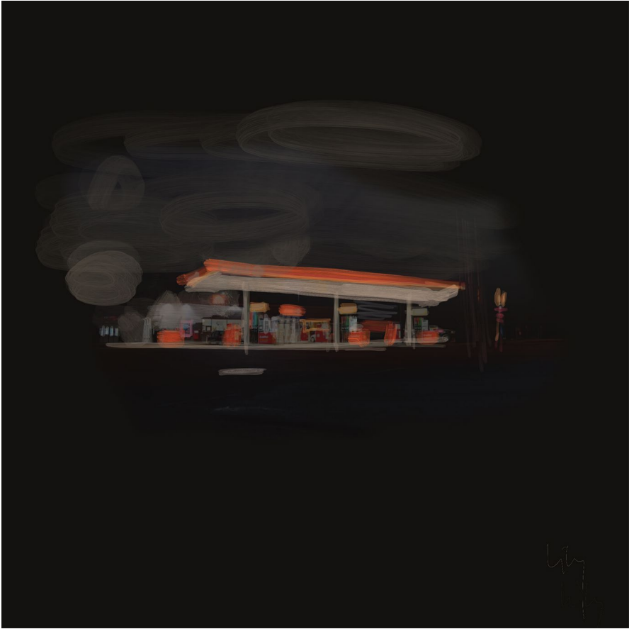
Fig. 3 A waypoint

hole, a safe space and petrol a drink proffered there to revive the weary. It might be something they sipped, while exchanging books, safe and surrounded by tarmac. Petrol sounded both natural and synthetic. Was it a nectar? Was it harvested by a host of tiny flying machines, borne on silver insect wings; sticky pollen free-riding, flower to flower, on glass and carbon cilia running down their legs? Did students sit outside at this station, on asphalt, oozing in the sun, amongst the piles of books, the smell of chamomile and all the flowers of the field drifting up from paper cups that brimmed with clear sparkling petrol?