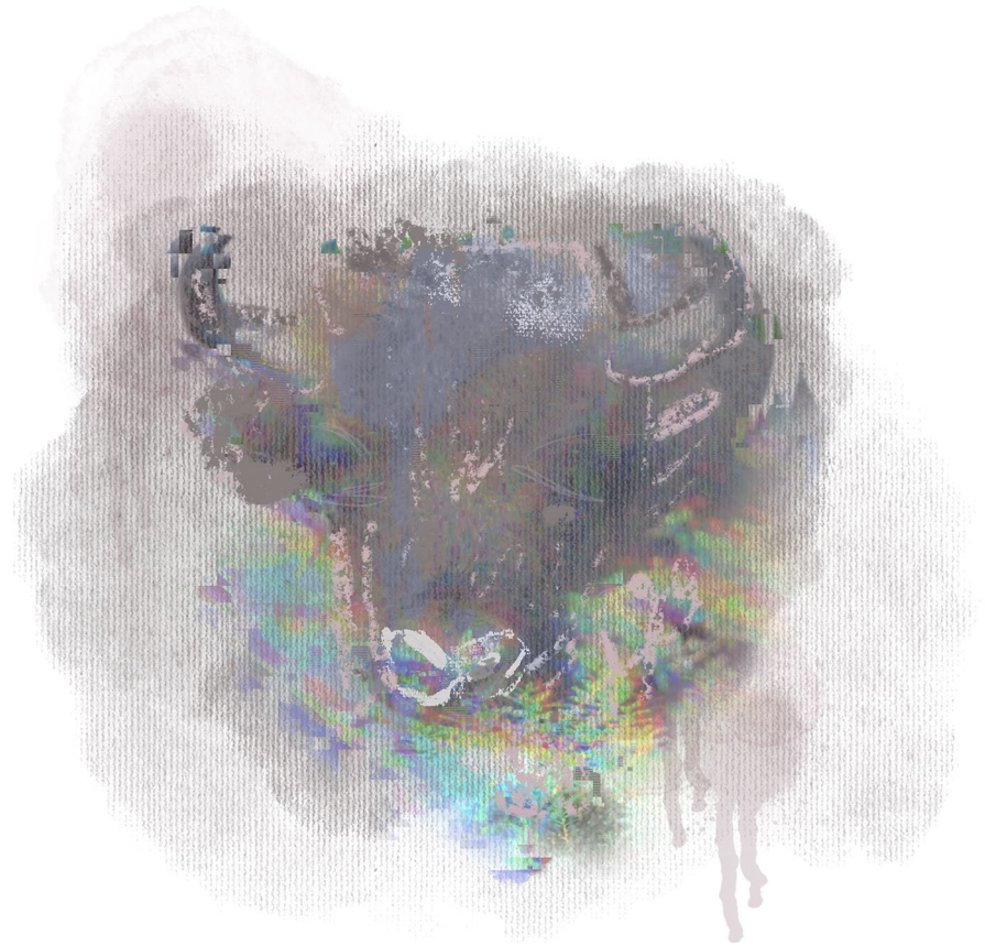
Fig. 2 Cattle pasture

A shorter route was through the flax field. There were no large horned animals in it, just a sea of flowers, purple petals held upon yellow discs, atop stems bent this way and that. These were the plants that grew the flax, for the linen of the linothorax, of the Archangels of University V (Aldrete et al. 2013).