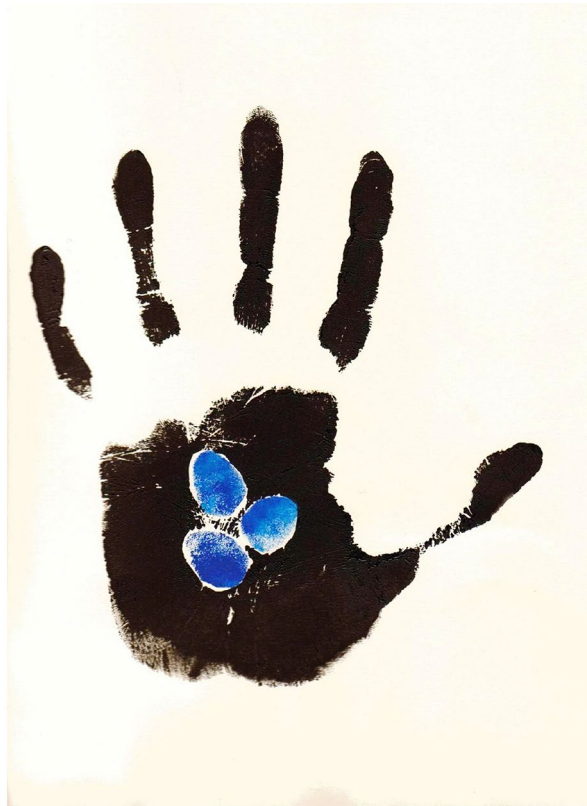
Fig. 1 Her nest on me

wheels on a gravel road', we know what she means. She means the crunch of a vehicle turning on a spilled stone surface, of someone coming, of dust rising in the train of movement. Hopefully, if you listen carefully enough to this article, you will also hear something approaching and in particular you should listen out for a bell.