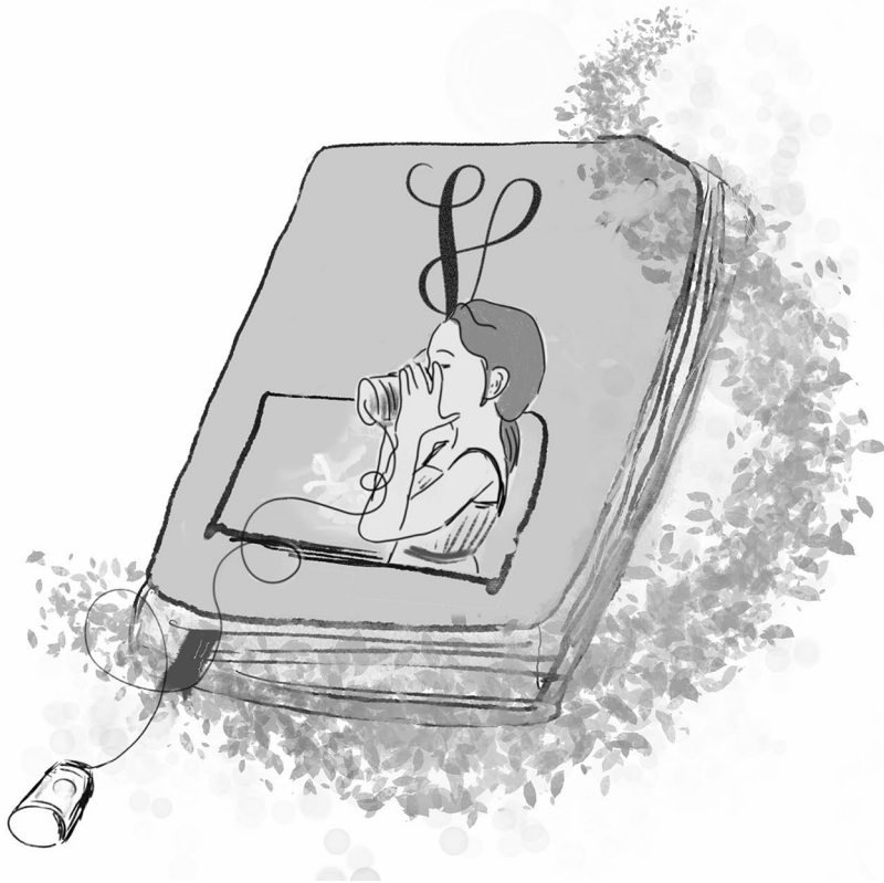
Fig. 4 'Horrible sociology book'