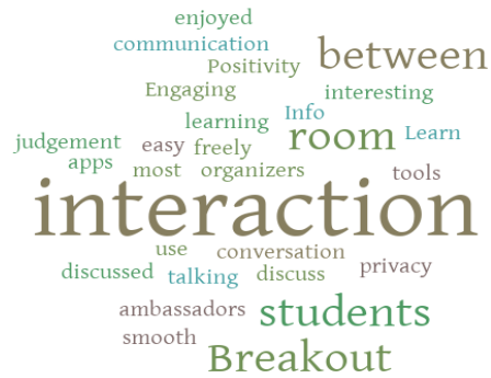
Fig2: What did participants like about the workshop?

Figs 1 and 2 show the results of the feedback collected from the post-workshop questionnaire about the learners' experience in the workshop. As it can be seen, all the participants seemed to have enjoyed the workshop and they liked most the level of interaction across all the different activities of the workshop. Hence, the evaluation of workshop 1 in terms of student experience with the workshop had very positive results. Students indicated it to be a fun learning experience with a high degree of interaction. Very few comments were made that indicated the preference for direct contact with the researchers and student ambassadors, but unfortunately, this is not possible due to COVID19 restrictions. The instructors were very positively rated as well (56.3% excellent, 25% very good, 18.8% good). Following this feedback, it was concluded that no interventions were necessary for the next 2 workshops.