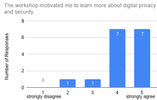
Fig4: Impact on learning about digital privacy and security

Figs 3 and 4 show the impact of the workshop on the participants' motivation on learning new concepts. As can be seen in the two figures, most participants agreed on the importance of the workshop and on motivating them to learn more about privacy, security and AI. We