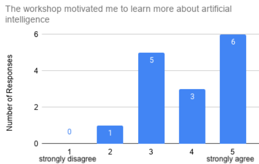
Fig3: Impact on learning about AI

Figs 1 and 2 show the results of the feedback collected from the post-workshop questionnaire about the learners' experience in the workshop. As it can be seen, all the participants seemed to have enjoyed the workshop and they liked most the level of interaction across all the different activities of the workshop. Hence, the evaluation of workshop 1 in terms of student experience with the workshop had very positive results. Students indicated it to be a fun learning experience with a high degree of interaction. Very few comments were made that indicated the preference for direct contact with the researchers and student ambassadors, but unfortunately, this is not possible due to COVID19 restrictions. The instructors were very positively rated as well (56.3% excellent, 25% very good, 18.8% good). Following this feedback, it was concluded that no interventions were necessary for the next 2 workshops.