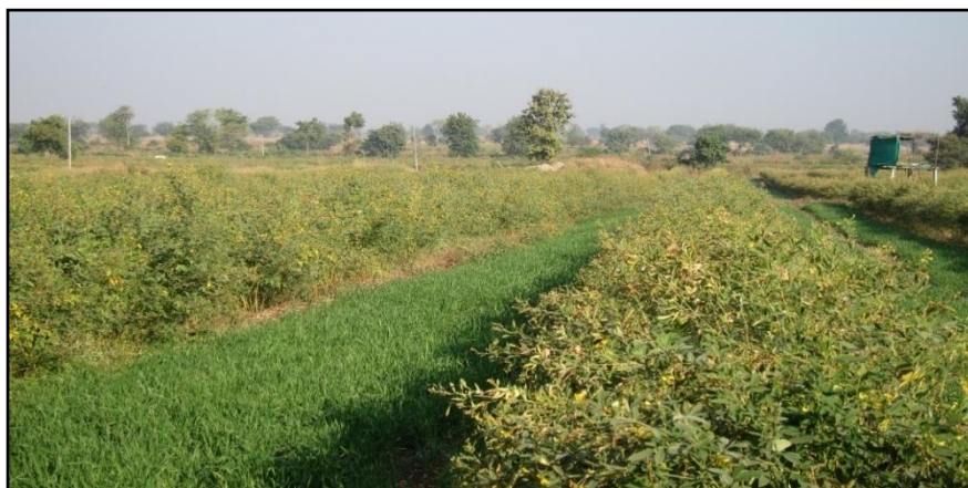
Figure 1. Pigeonpea + soybean followed by wheat (after harvesting soybean rows)