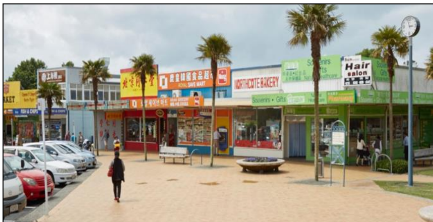
Figure 1 Northcote town centre

Urban change, including population growth and the emergence of new kinds and expressions of diversity, raises important questions for policy makers, community service agencies, and local residents alike. These project briefs are designed to provide research findings related to the meanings and practices of community within neighbourhoods (CaDDANZ Brief 8), how people see difference and how diversity impacts residents' sense of home and community (CaDDANZ Brief 9), the significance of the local neighbourhood for the wellbeing of older adults (CaDDANZ Brief 10), and residents' perceptions and experiences of the Northcote Development (CaDDANZ Brief 11).