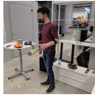
Fig. 1. The experiment setup included a Myo armband for sEMG, an i-LIMB revolution prosthetic hand, a computer, and several household objects.

We compared one standard open-loop data acquisition procedure, used to reduce the influence of the limb position on myocontrol, to two novel closed-loop acquisition protocols. During closed-loop data acquisition, information about the model’s accuracy was fed back to the subjects using an acoustic signal, a design choice easily integrable in daily routines for myocontrol training and recalibration. The feedback signal ultimately guided subjects to enforce training