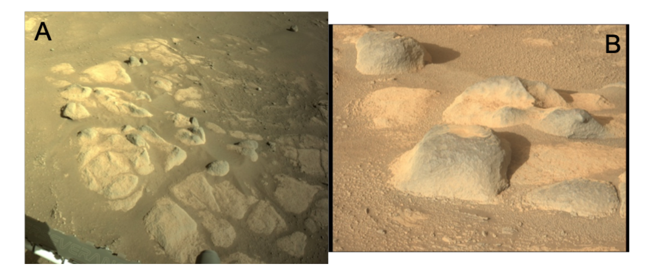
Figure 1: A. NavCam image of the workspace, sol 66 (N_LRGB_0066_RAS_0032208_CYP_S_STERONVJ01); B. MastCam image showing pavers and high standing dark-toned rocks (ZCAM03130).

One important observation concerns the point-to-point dispersion among each rock, whatever the rock type. This shows that the granulometry of these rocks is quite important, with grains of at least 300 microns (which is the LIBS spot size). Several grains have indeed been observed in the RMI and Watson images, consistent with this hypothesis.