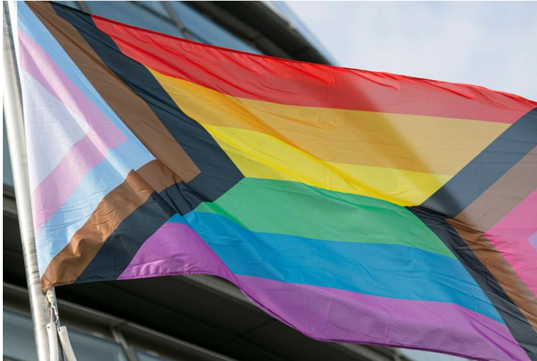
Figure 4 The new pride flag, which is inclusive of trans, Black, and Brown bodies and acts as a prominent symbol that evokes feelings of belonging and acceptance for many queer racialized folks (Image sourced from Greater London Authority in, Wareham, 2020).

The way spaces are imagined, the various symbols they hold, and what they represent demographically all combine to produce a narrative that signals to QTBIPOC whether they would be perceived or welcomed as potential patrons. Thus, to foster and support environments that are more mindful of QTBIPOC lived realities, it is imperative that planners, other city-builders, councilors, City staff, and leaders of queer spaces begin to identify, unpack, and remove factors that perpetuate spatial-visual as well as morphological divisions.