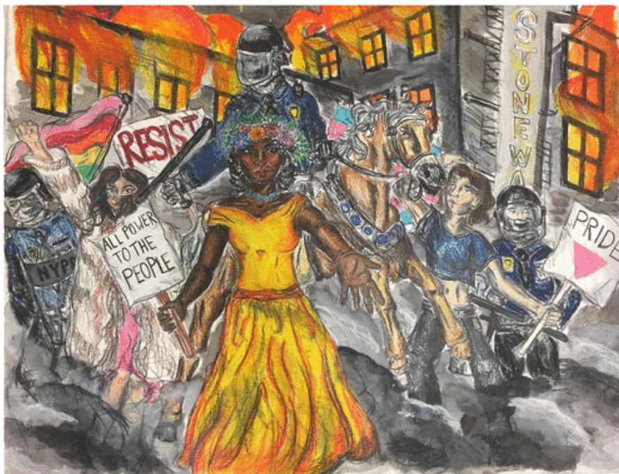
Figure 5 Image depicting Marsha P. Johnson and Sylvia Rivera being confronted by NYPD at the Stonewall Riots by Alec Black .

The way spaces are imagined, the various symbols they hold, and what they represent demographically all combine to produce a narrative that signals to QTBIPOC whether they would be perceived or welcomed as potential patrons. Thus, to foster and support environments that are more mindful of QTBIPOC lived realities, it is imperative that planners, other city-builders, councilors, City staff, and leaders of queer spaces begin to identify, unpack, and remove factors that perpetuate spatial-visual as well as morphological divisions.