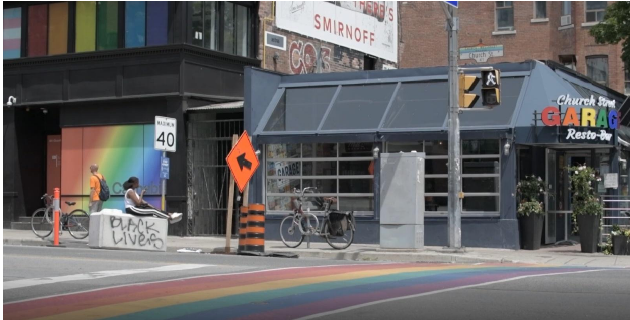
Figure 3 Still of a Black woman sitting on a stone block that features a graffiti with the words "Black Lives" along Church Street.