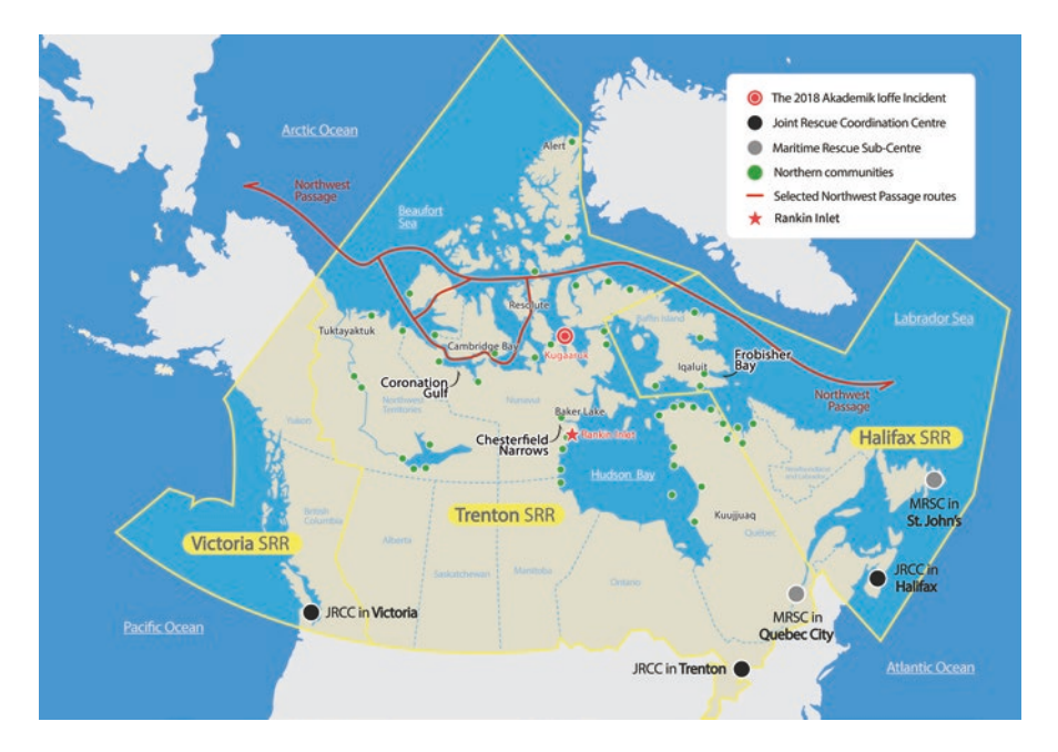
Fig. 5.1 SAR centres in the Canadian Arctic and the 2018 Akademik Ioffe incident (Office of the Auditor General of Canada 2013, 2014)

The Canadian Arctic, and in particular the Northwest Passage (NWP), which extends 1450 km, is a uniquely complex navigational area consisting of multiple routes as shown in Fig. 5.1. Its characteristics include a combination of (1) a huge geographical area accounting for 40% of Canada's land mass (Esri n.d.); (2) an extensive and complicated coastline with landfast ice in many areas; (3) an estimated 50,000 giant icebergs as well as drifting ice accompanied by strong winds,