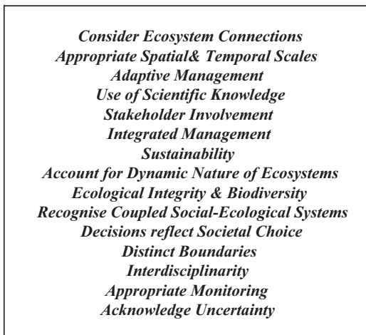
Figure 1 The key principles of EBM as derived from the theoretical/conceptual/institutional EBM literature. (Long et al. 2015).

These priorities are reflected fairly well across all three types of fisheries (with a slightly greater weight from the lobster fishermen being due to a higher proportion of that group having been interviewed). Note that although the definition of each principle was provided, the fishermen would have, in any case, recognized and related to the widely publicized term Sustainability , more so than some of the other EBM principles; this may in part