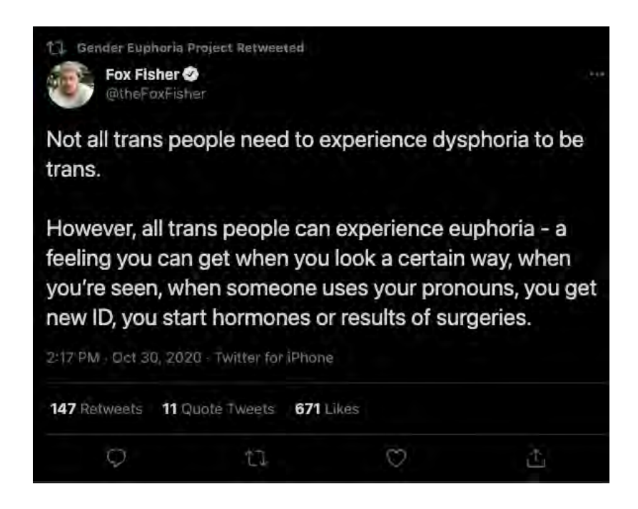
Image description: A Tweet (17) from @theFoxFisher states the following: Not all trans people need to experience gender dysphoria to be trans. However, all trans people can experience euphoria – a feeling you can get when you look a certain way, when you're seen, when someone uses your pronouns, you get a new ID, you start hormones or results of surgeries.

The author recognizes that trans identities invite the possibility of euphoria independent of dysphoria. Furthermore, he suggests that euphoria may better encapsulate trans and nonbinary identities than gender dysphoria. Although gender euphoria originates as a negative definition of dysphoria, the testimony of trans and nonbinary individuals suggest that gender euphoria can represent much more.