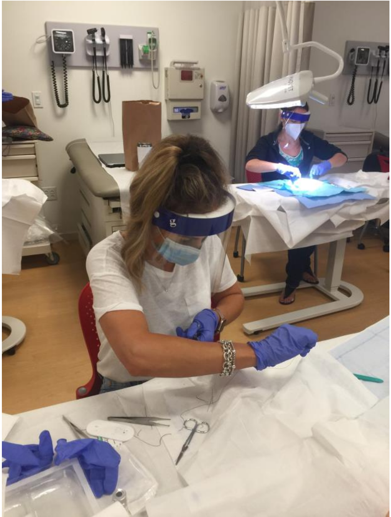
New Frontiers for NP Education April 21st – April 25th, 2021