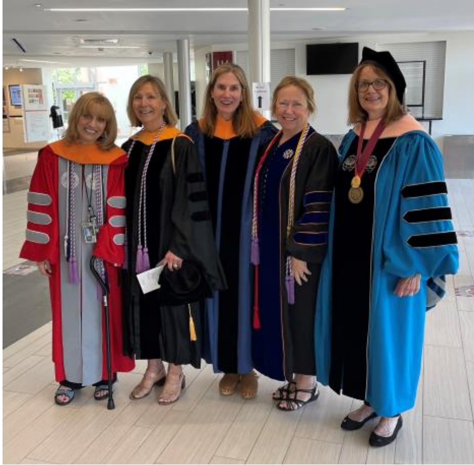
1 - Family Nurse Practitioner/Doctor of Nursing Practice Program Faculty