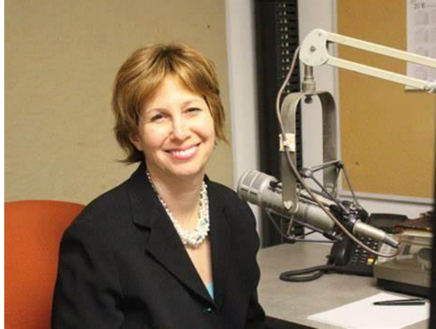
5 - WICC Radio, Bridgeport, CT March 8, 2021

Click here to be Directed to the Interview 2