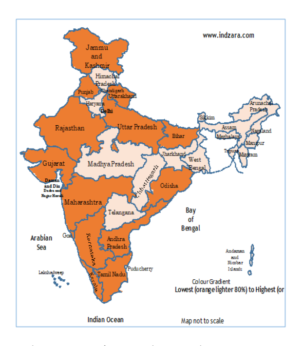
Fig. 1.1: Geographic Heat Map of states with Major Pilgrimage Tourism in India (Data Source: Ministry of Tourism, GOI). Data used is prior to the bifurcation of J& K in 2019.