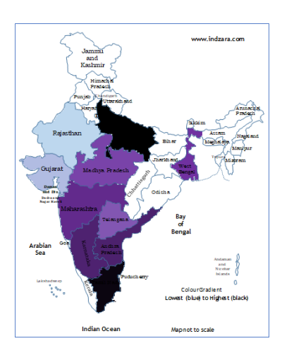
Fig. a. Geographic Heat Map showing top Indian states for domestic tourist visits in 2019.