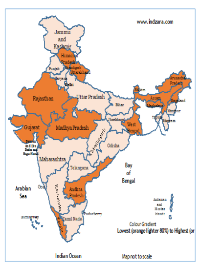
Fig. 1.2: Geographic Heat Map of states with largescaleRural and Natural Tourism in India. Data used is prior to the bifurcation of J& K in 2019.

mountains, pristine beaches, cultural heritage and religious sites. The government of this state works towards making tourism more sustainable by making the population more community conscience. They promote rural tourism by working closely with the local communities. Among the north-eastern states, Mawlynnong in Meghalaya has emerged as one of the favourite village tourism destinations in the country. The clean environment and famed bridges show their commitment towards Mother Nature. This is why it is called 'God's own Garden'. Sikkim is a state with rich flora and fauna. It is home to the mighty Kanchenjunga, the third highest mountain in the whole world. The state government is taking measures to develop sustainable tourism especially around the forests and the areas surrounding them. Assam is home to endangered One-Horned Rhinoceros in the Kaziranga National park. The unique characteristic of Assam is the River Brahmaputra which flows right through the state. Arunachal Pradesh is the wildest state of India. Arunachal Pradesh has 26 remote mountain valleys and has a culture rich in indigenous tribal traditions that attract travelers to this place.