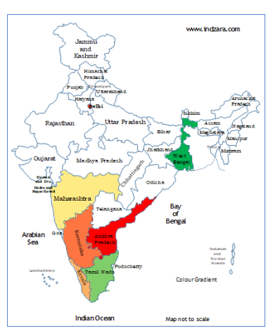
Fig. 1.3: Geographic Heat Map of Top States for Medical Tourism in India (Data Source: Ministry of Tourism, GOI). Data used is prior to the bifurcation of J&K in 2019.

Among the South Indian states, Andhra Pradesh has Hyderabad advanced in the fields of biotechnology pharmaceuticals. The city of Hyderabad solely has more than 10,000 beds and around 540 hospitals. Close proximity of hospitals to air hubs, affordable accommodation near healthcare centers and easy tourist vehicle availability make it a very convenient destination for medical travelers. In Kerala, the linkage between tourism and hospitals is exceptional. Kerala's expenditure on the medical sector is 9 percent of its GDP which is very high compared to other states. Keeping traditional methods alive, Ayurveda is a major focus in Kerala. The state also offers almost all kinds of advanced treatments and a healing environment for post-treatment recovery. The government of Tamil Nadu is active in providing cost-effective medical treatment. There are numerous state of the art health institutions mainly in the state capital, Chennai. Madurai, Vellore and Coimbatore are some of the other cities offering good medical services. CMC Vellore is known for conducting India's first heart valve transplant. Eye care is one of the fields in which Tamil Nadu specialises. In Karnataka, the cities of Bangalore and Mysore have a number of super-specialty hospitals. Some of them are ISO certified government hospitals. Healthcare services in Bangalore offers a unique mix of yoga, Ayurveda and modern methods of treatment to attract foreign tourists.